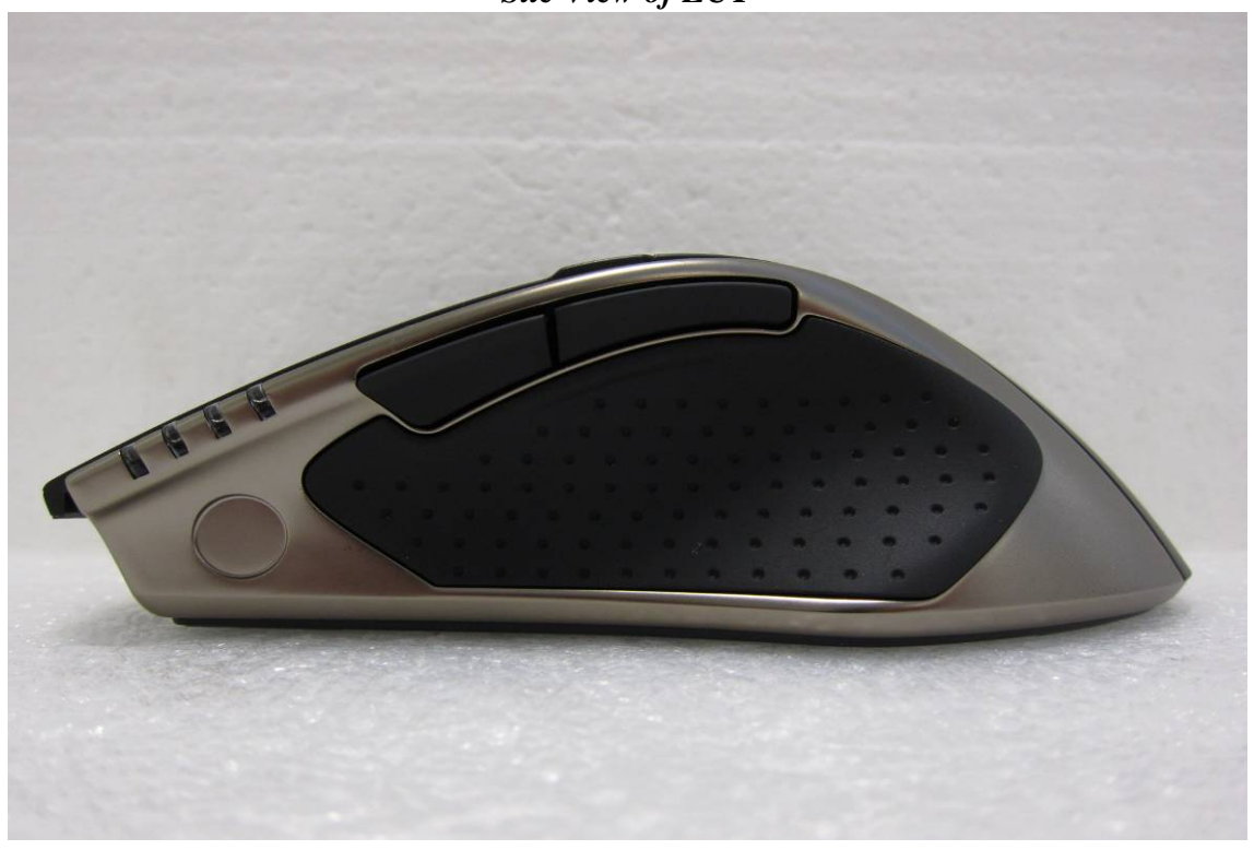
Site View of EUT