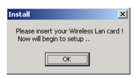
Step 4: Click "OK".