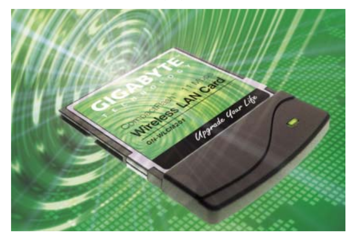
Dimensions: 55.4mm* 43mm* 3.3mm

This wireless LAN card conforms to the Compact Flash Type I standard. There is one LED-indicating lights to indicate Act/Link status.