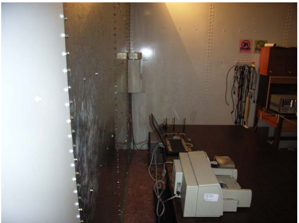
End of report