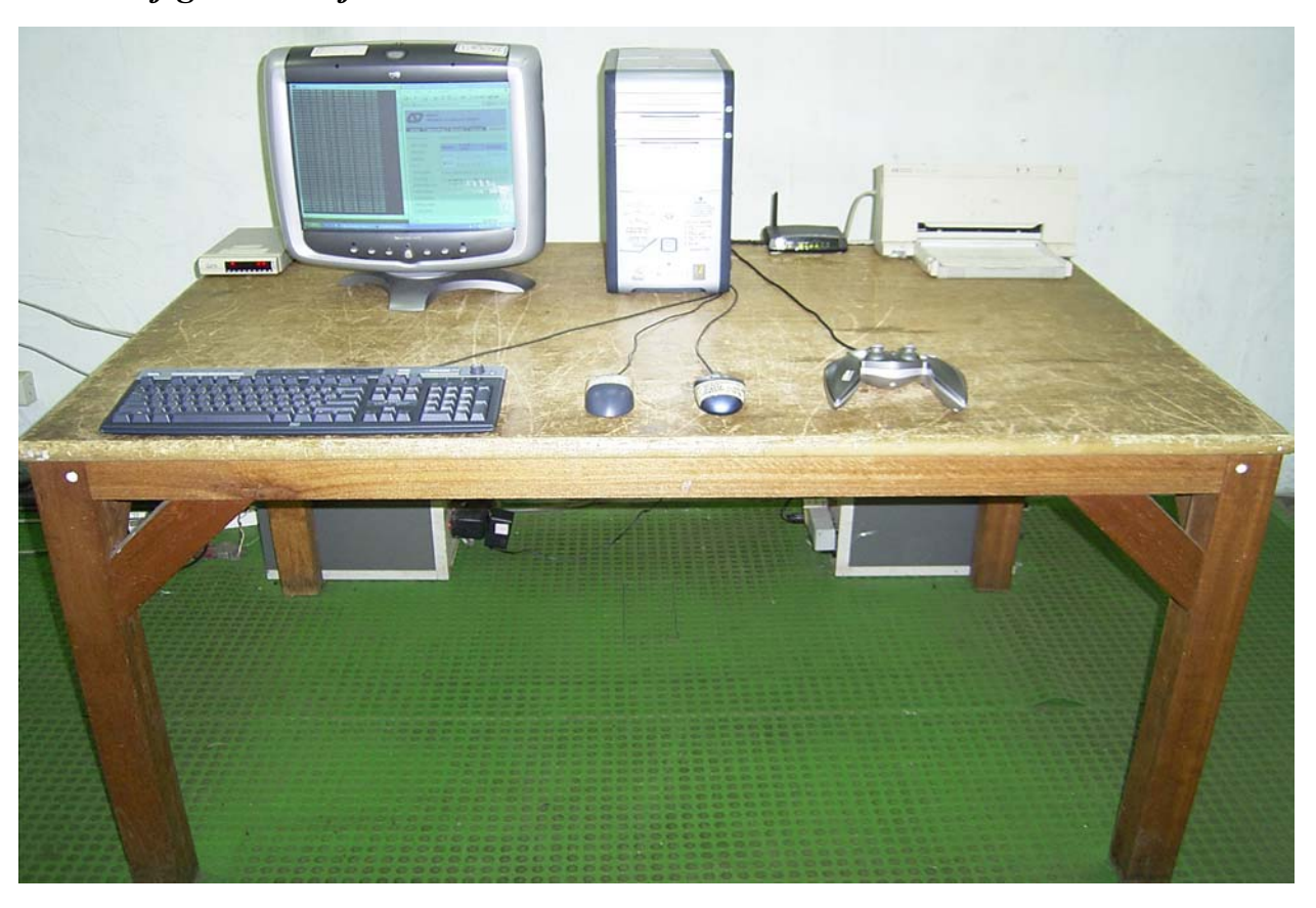
The Configuration of the Conducted Test: