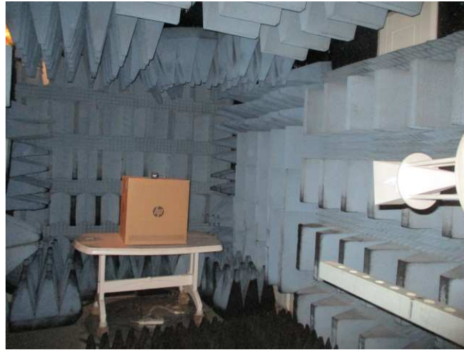
Figure 5. Radiated Emission Test, 18-26.5 GHz