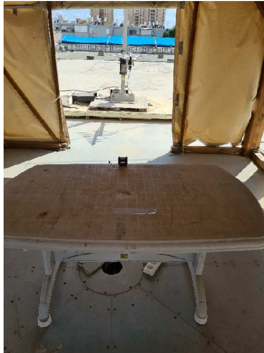
Figure 3. Radiated Emission Test, 200.0-1000.0 MHz