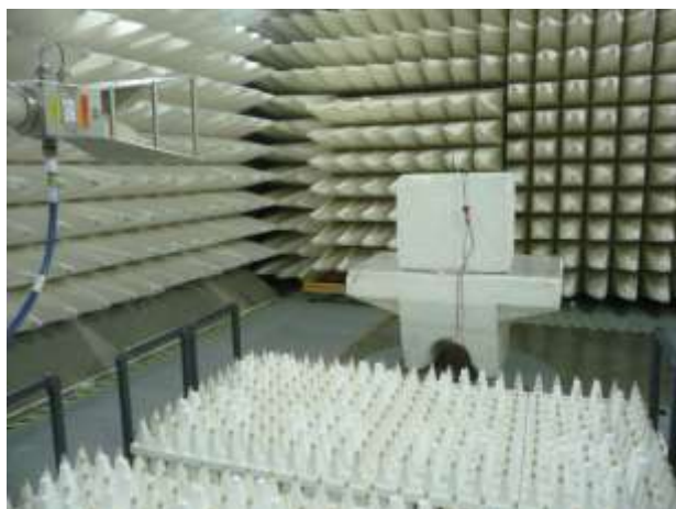
Photograph No.1 Setup for OBW, band edge emission and hopping parameters measurements