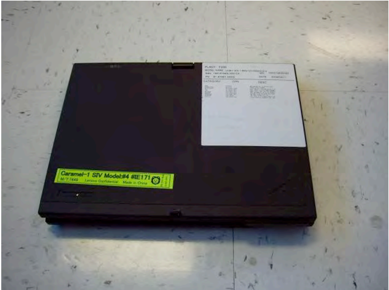
Figure 12-1 External View of Notebook (closed)