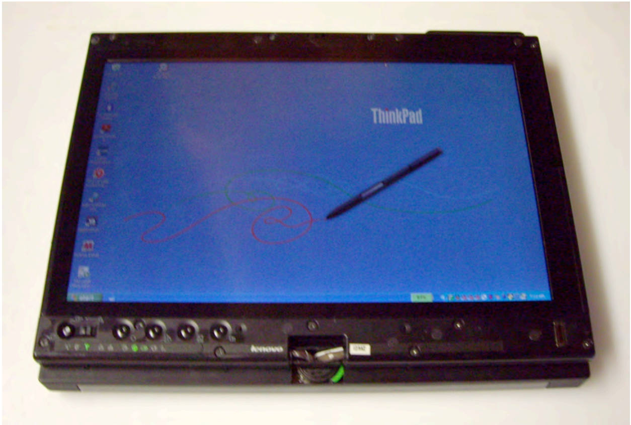
Figure 11-1 External View of Notebook Configured as a Tablet