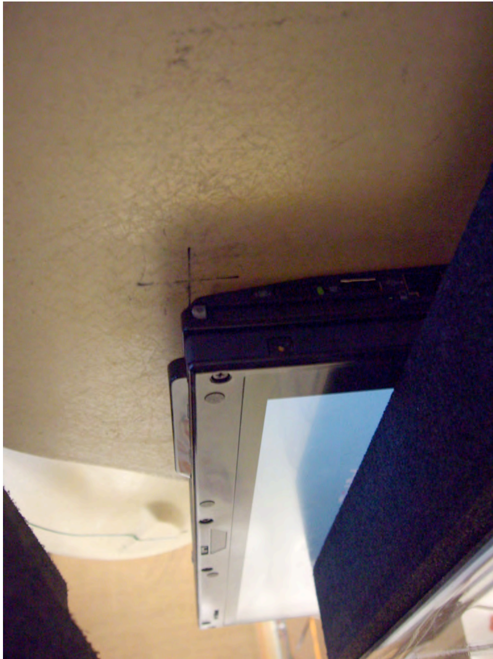
Figure 11-5 Notebook positioned under flat section of phantom, Tablet position