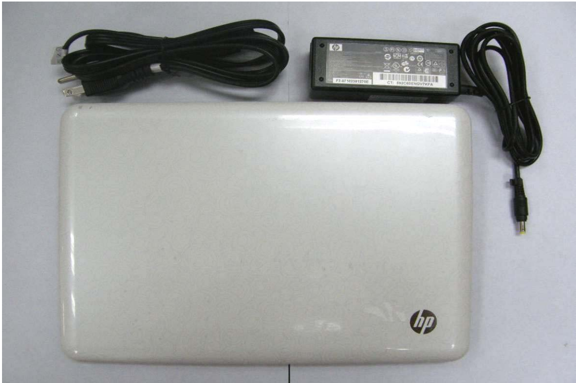
Front View of EUT – 2