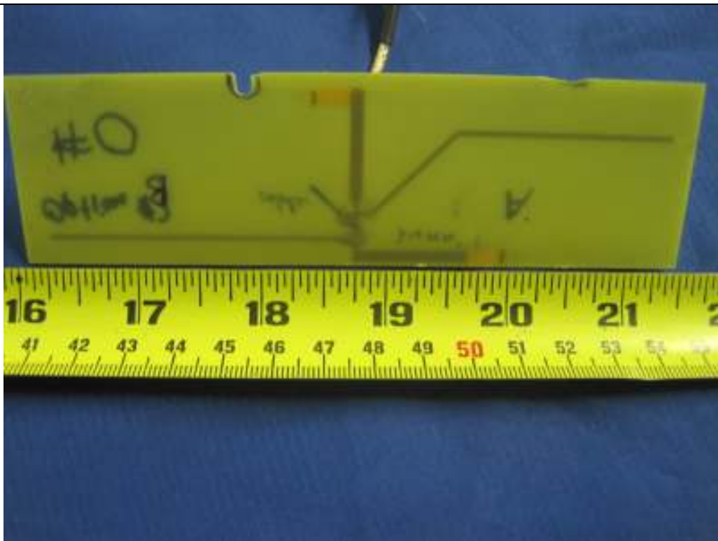
EUT Antenna Rear View