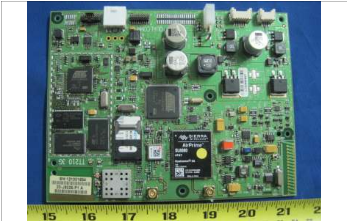
PCBA 1 Top View