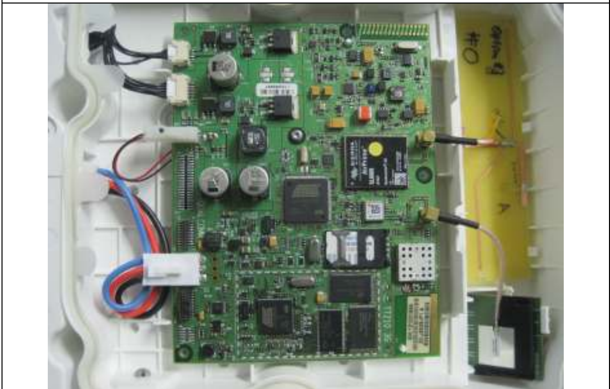
EUT Cover off Closer View 2