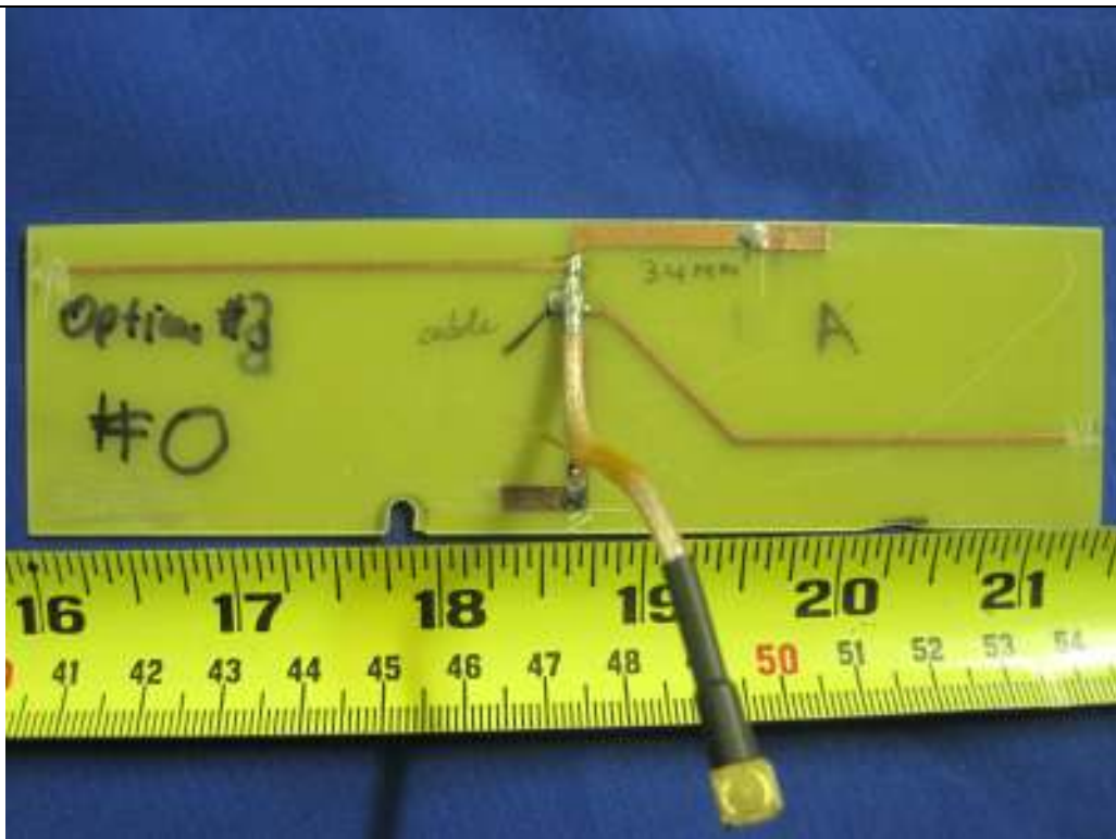
EUT Antenna Front View