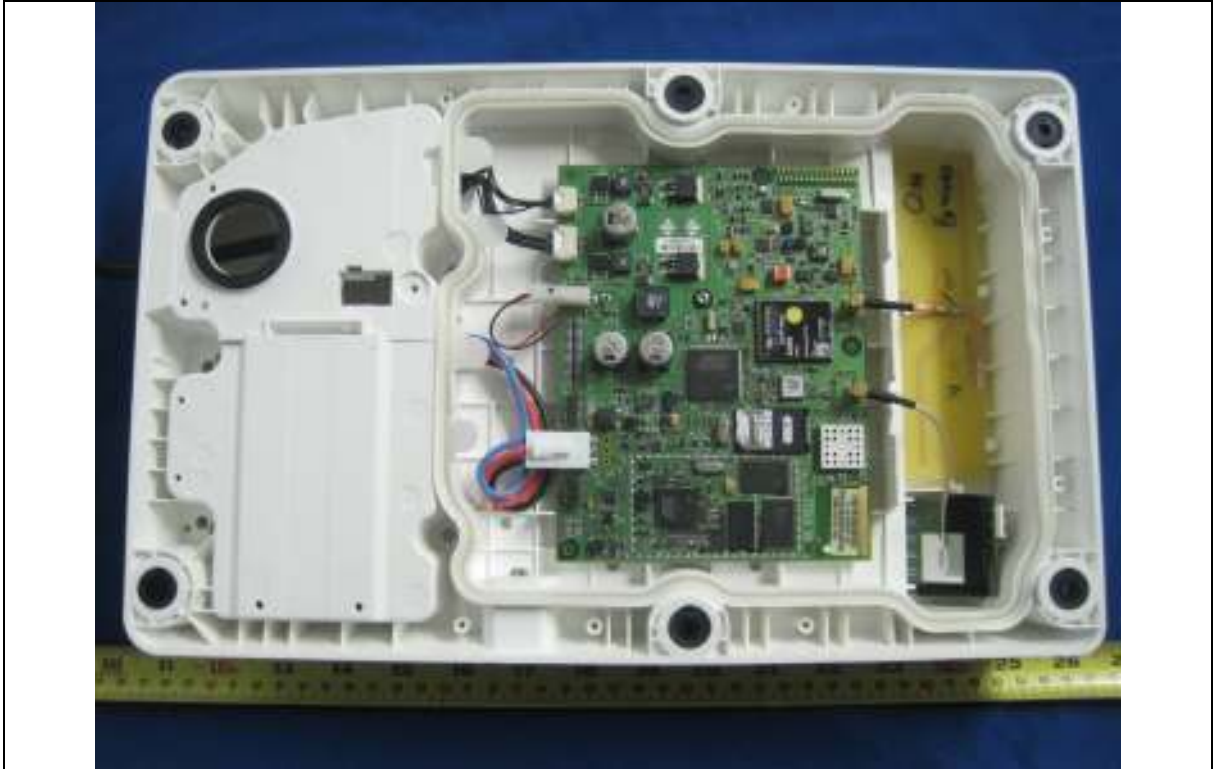
EUT Cover off View 1