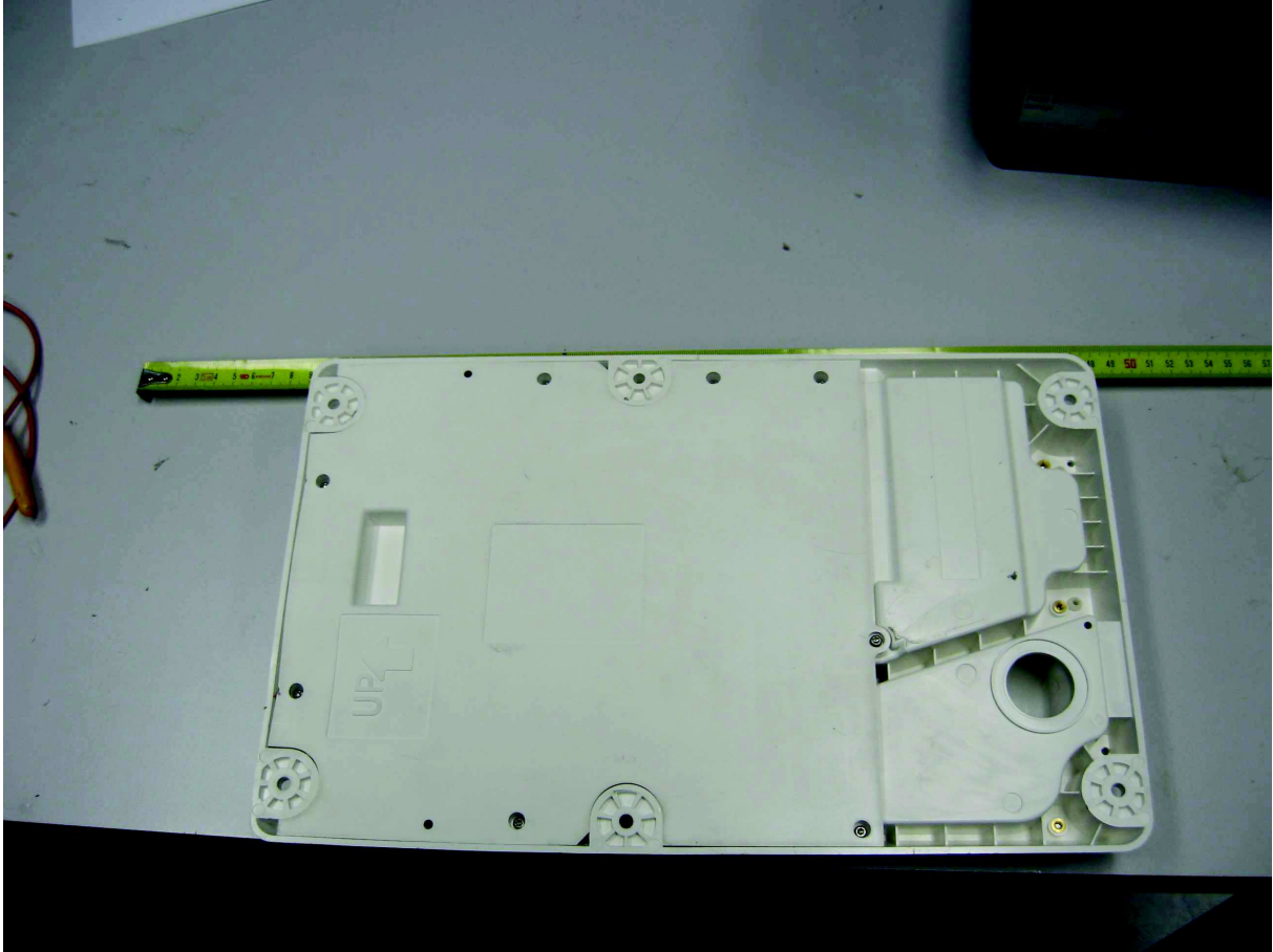
Bottom view of the EUT