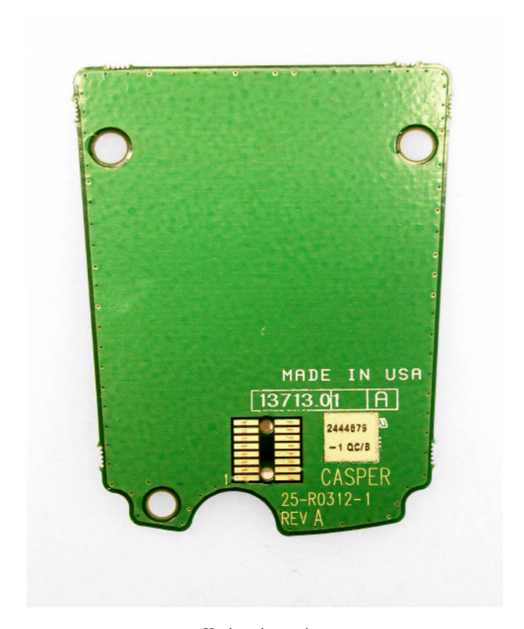
Keyboard rear view