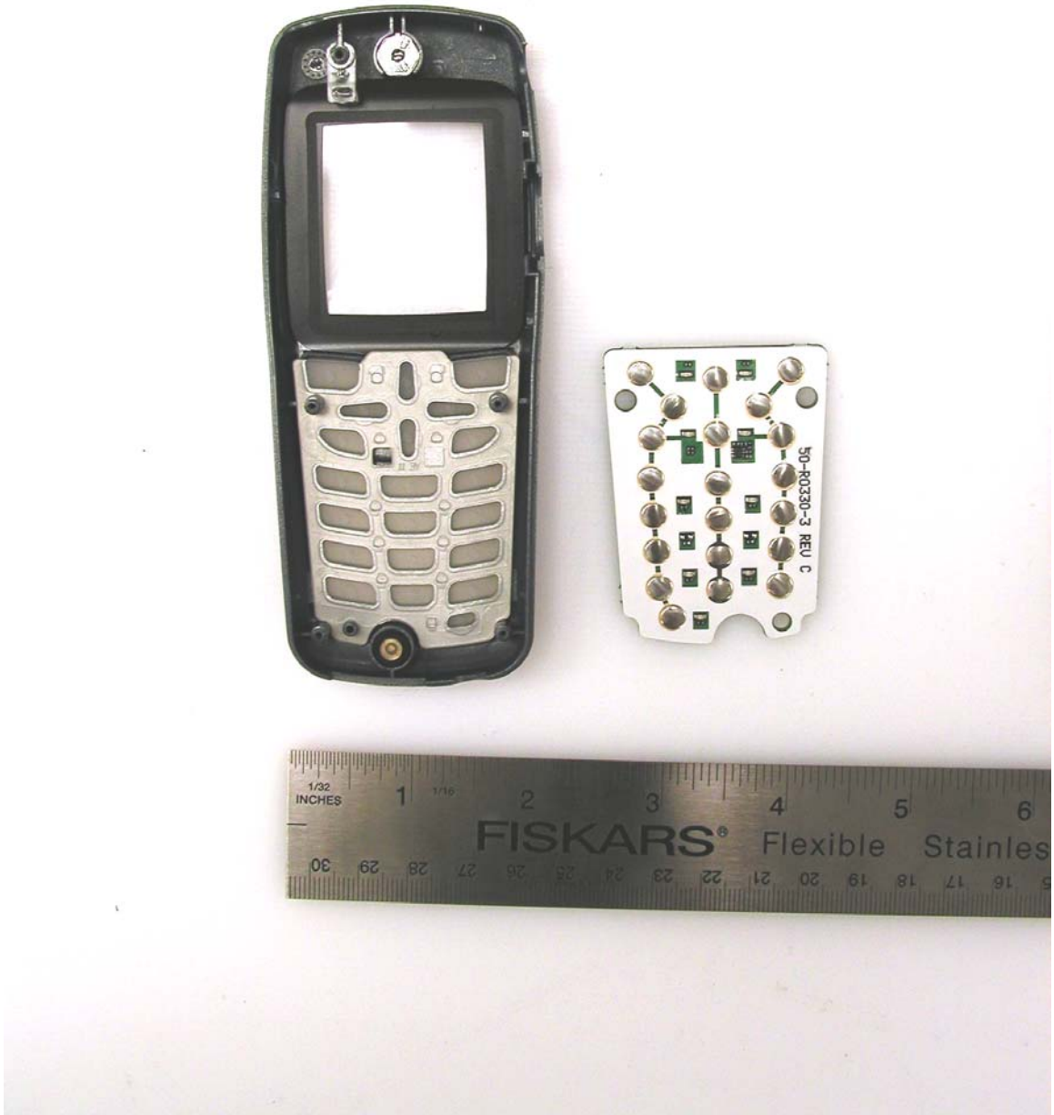
Front housing with keypad printed wiring board removed