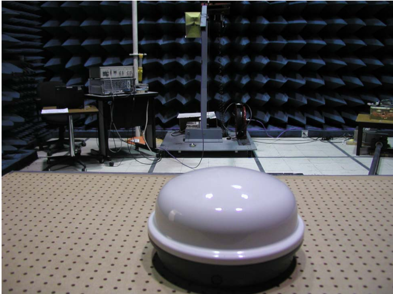
Figure E-2. SDM radiated test setup