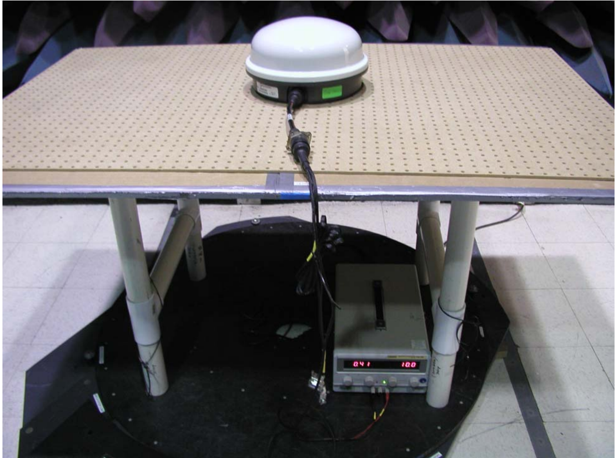
Figure E-1. SDM in radiated measurement