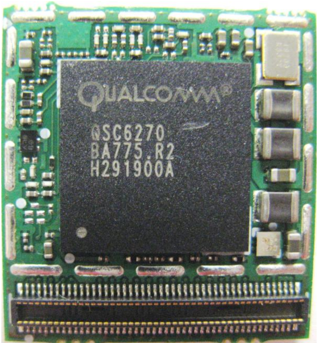
Figure 1 IEM6270 Internal Photo: Front