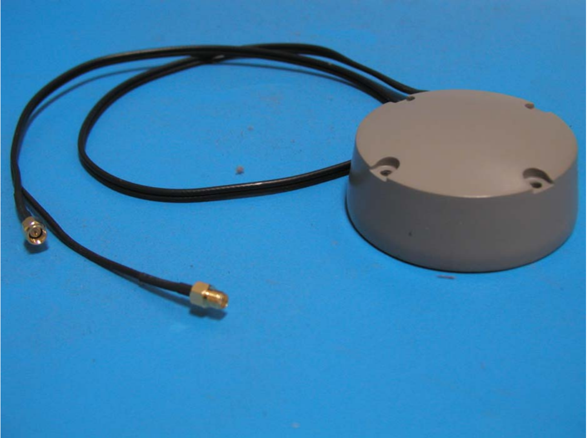
Figure 8 HFK External- ODU Antenna