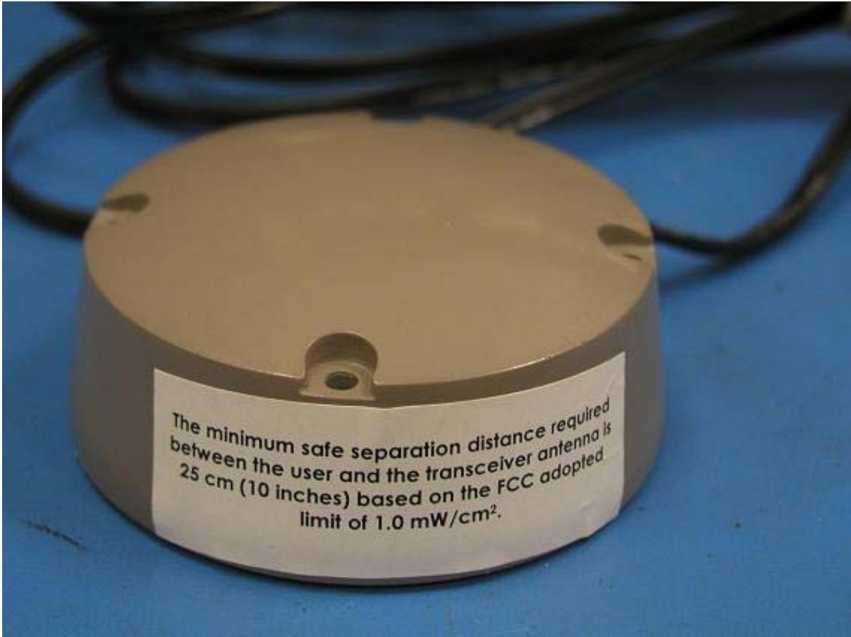
Figure 9 Antenna Label 1