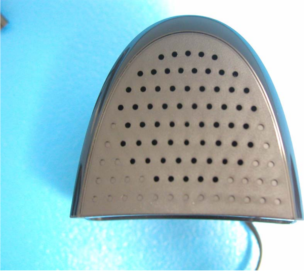
Figure 13 Speaker Front