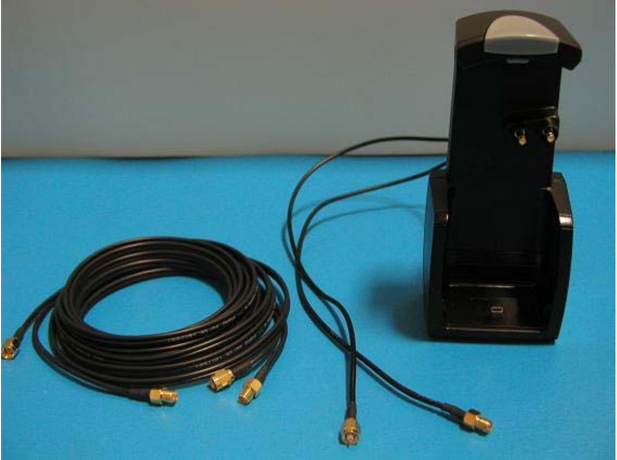
Figure 2 HFK External- Cables