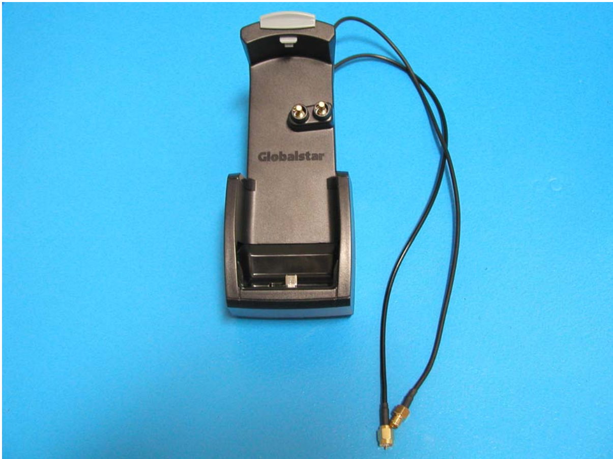
Figure 1 HFK External -Front