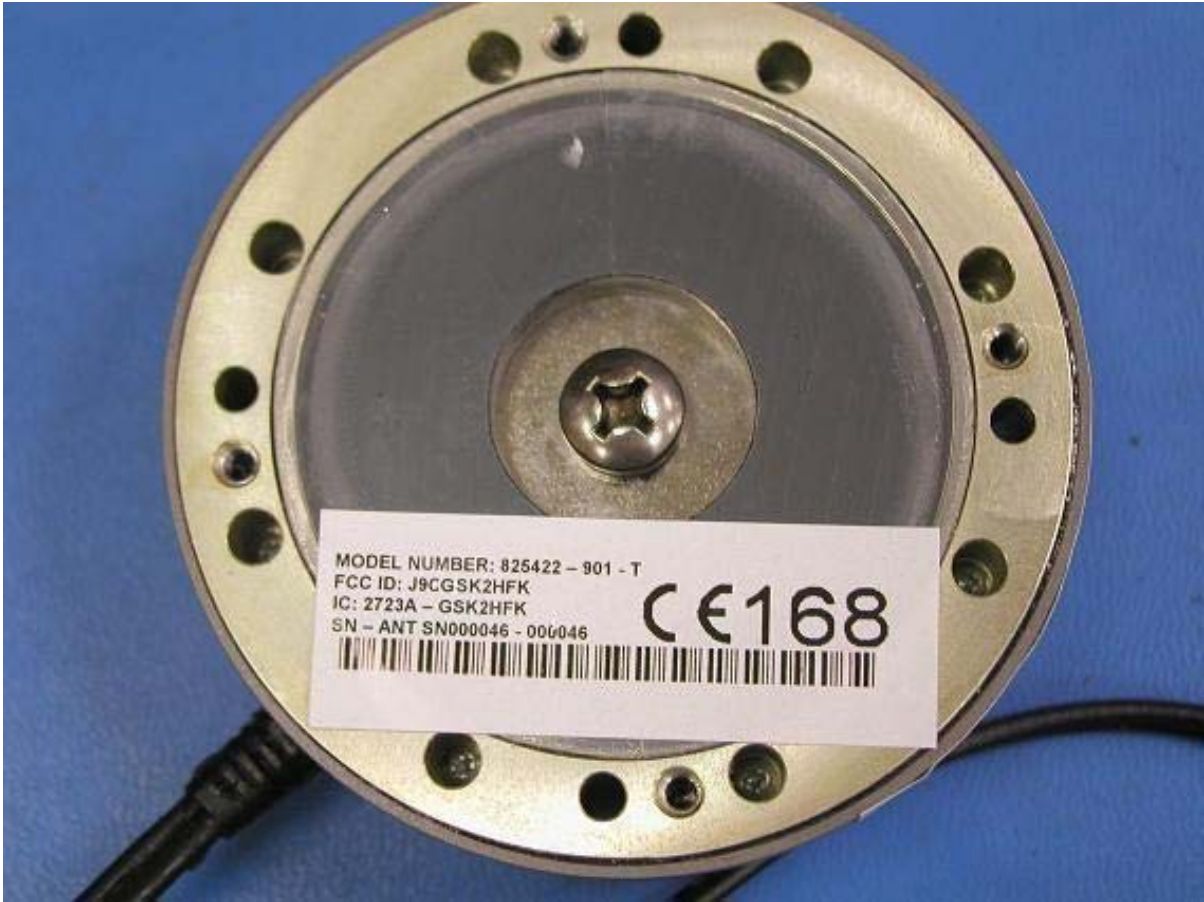
Figure 10 Antenna Label 2