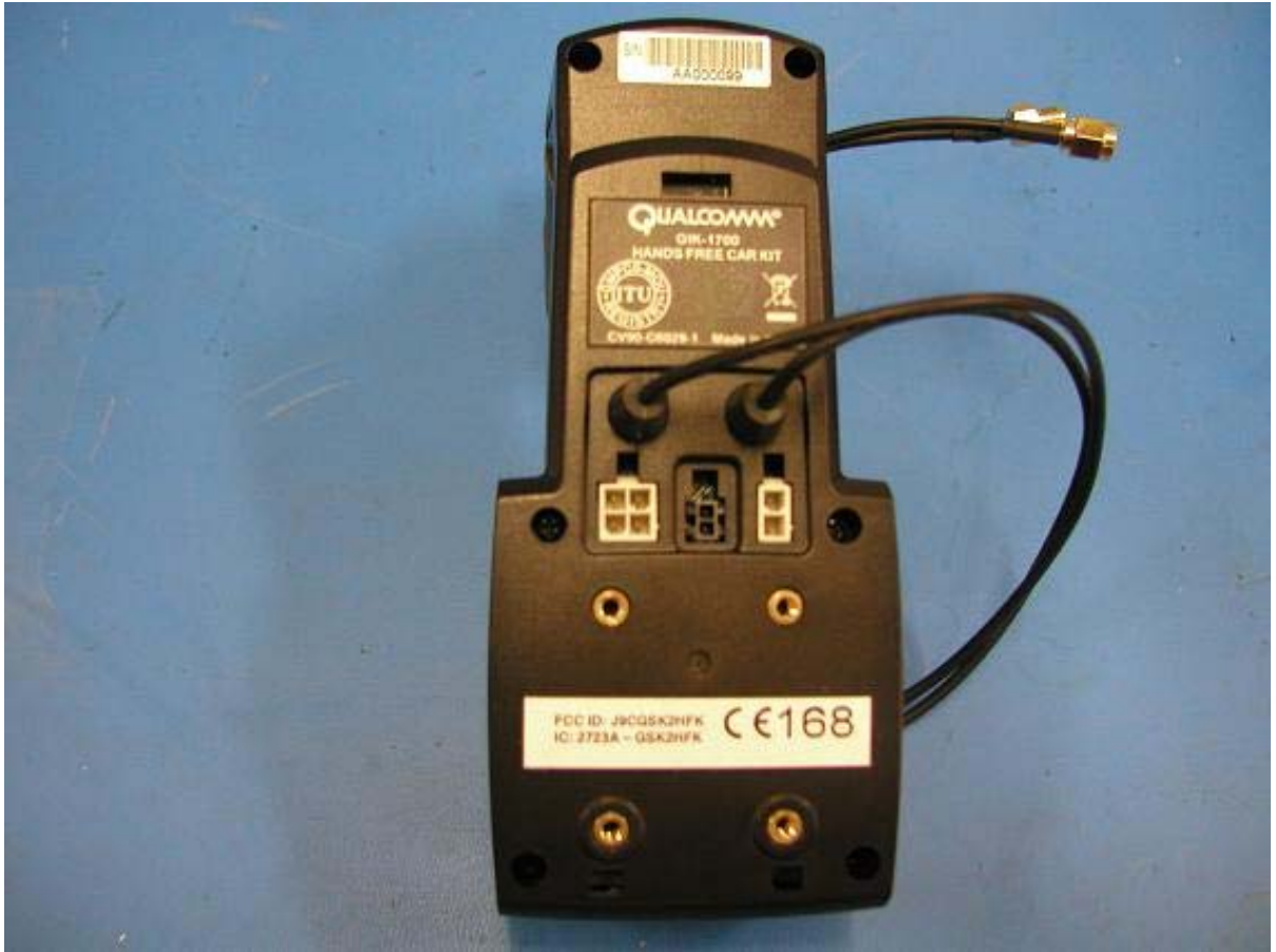
Figure 3 HFK External- Back