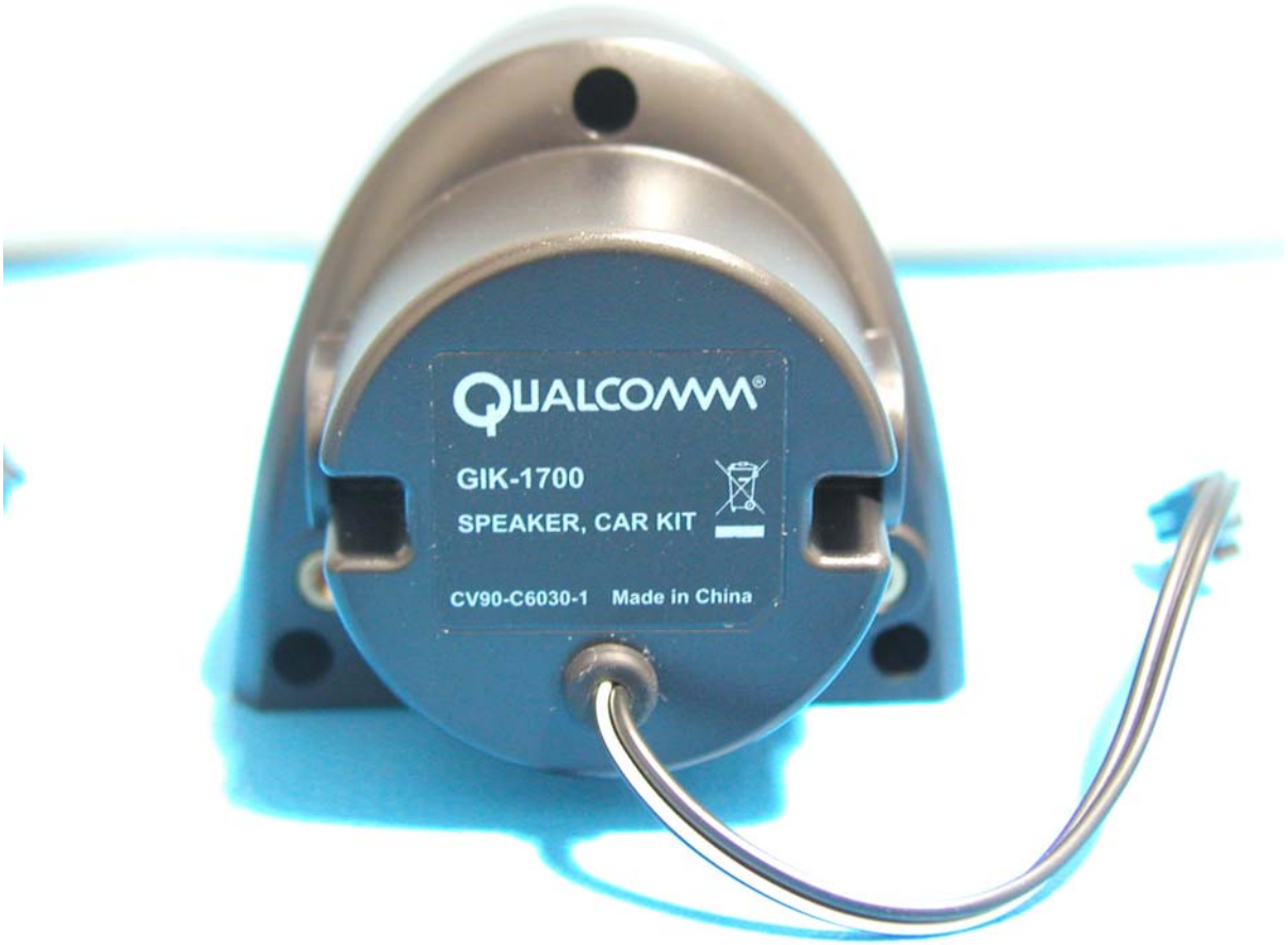
Figure 12 Speaker-Rear View