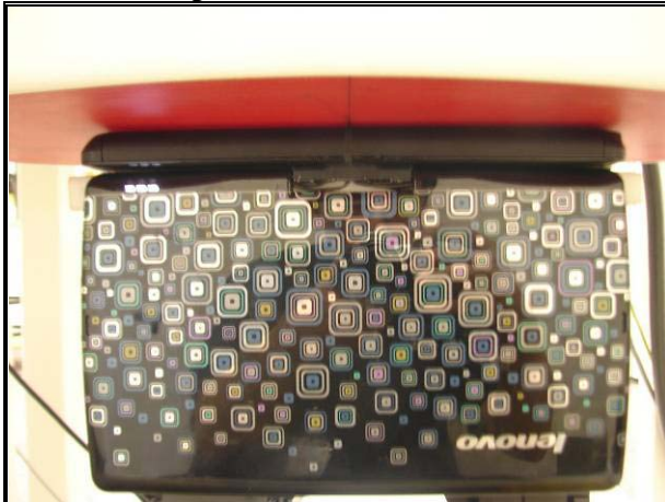
NB configuration, lap-held