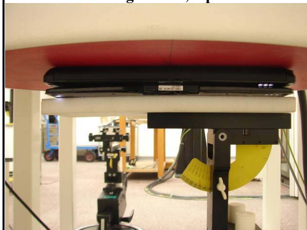
Tablet configuration, lap-held