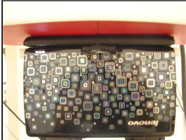
NB configuration, lap-held