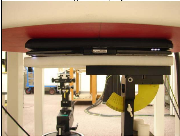
Tablet configuration, lap-held