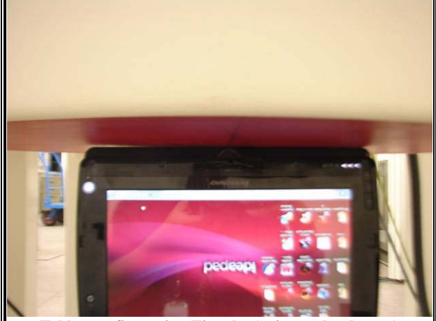
Tablet configuration Tip edge(primary landscape)