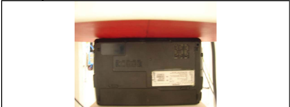
Tablet configuration Rear edge (secondary landscape)