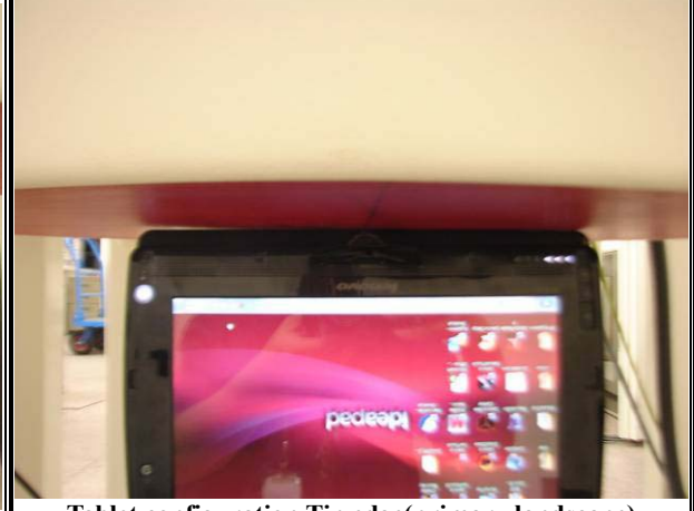
Tablet configuration Tip edge(primary landscape)