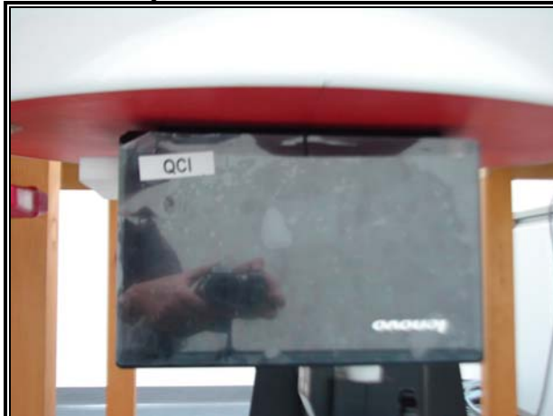
Bottom Flat 1