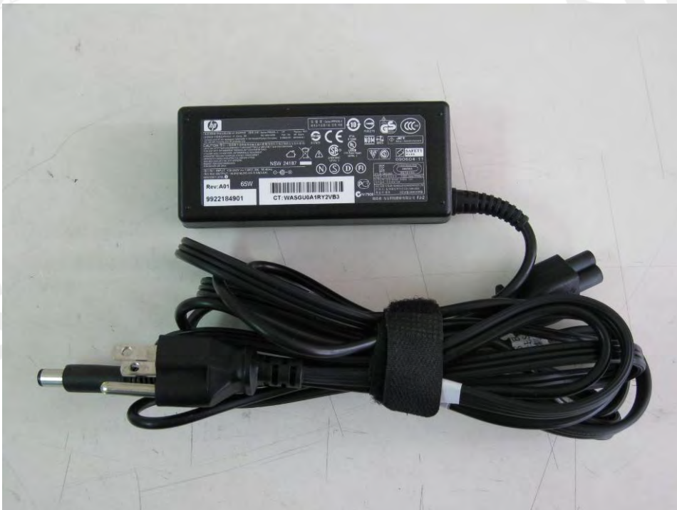
Fig.10 AC charger

Unless otherwise stated the results shown in this test report refer only to the sample(s) tested and such sample(s) are retained for 90 days only. 除非另有說明，此報告結果僅對測試之樣品負責，同時此樣品僅保留90天。本報告未經本公司書面許可，不可部份複製。