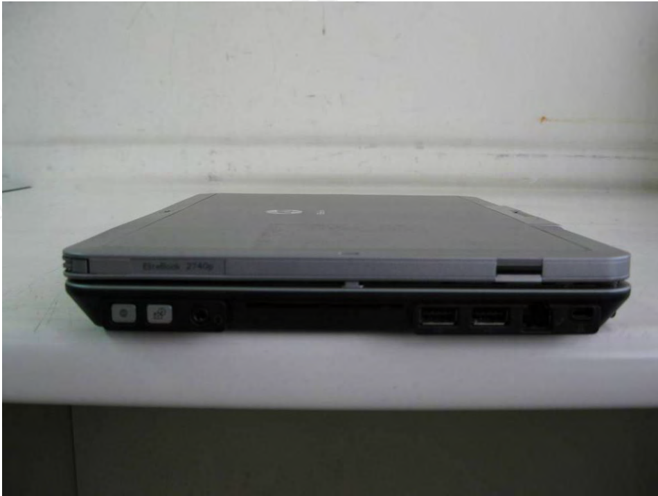
Fig.9 Right Side of EUT