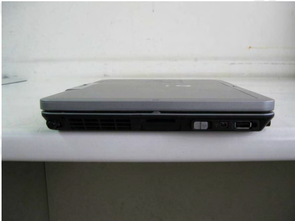
Fig.8 Left Side of EUT

Unless otherwise stated the results shown in this test report refer only to the sample(s) tested and such sample(s) are retained for 90 days only. 除非另有說明，此報告結果僅對測試之樣品負責，同時此樣品僅保留90天。本報告未經本公司書面許可，不可部份複製。