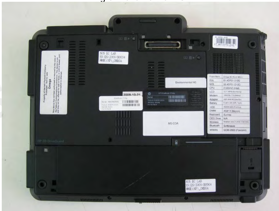
Fig.6 Back view of EUT

Unless otherwise stated the results shown in this test report refer only to the sample(s) tested and such sample(s) are retained for 90 days only. 除非另有說明，此報告結果僅對測試之樣品負責，同時此樣品僅保留90天。本報告未經本公司書面許可，不可部份複製。