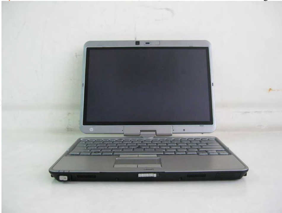
Fig.7 Fold up of EUT