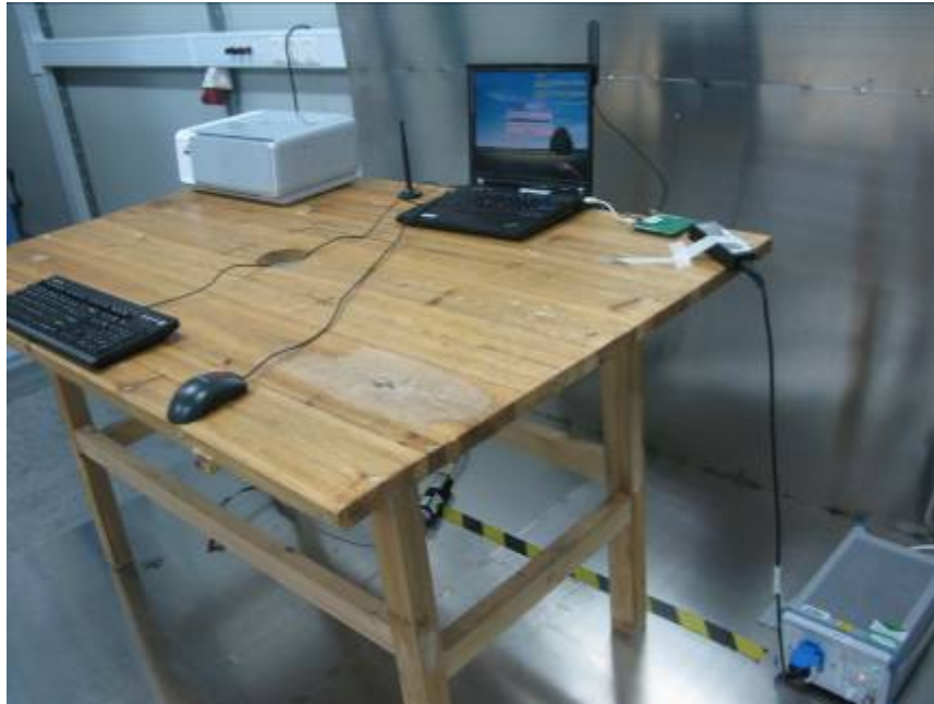
Conducted Emissions for AC Power