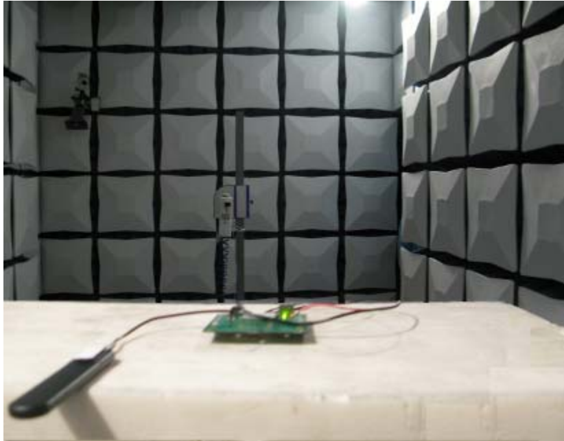
Radiated Spurious Emission 18G~26.5GHz