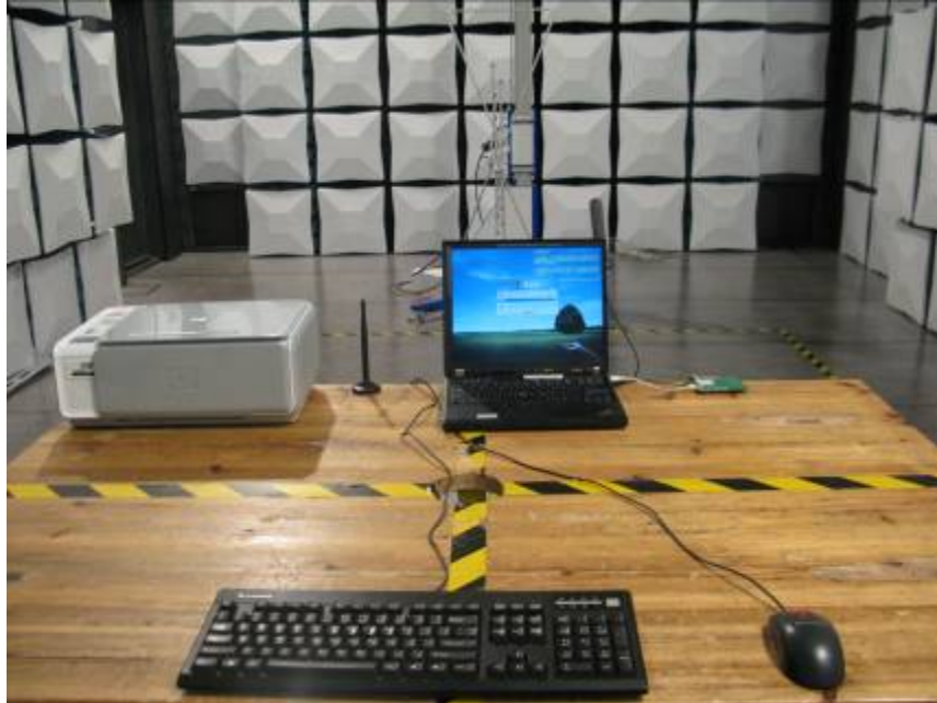
Radiated Disturbance (30MHZ-1GHZ)