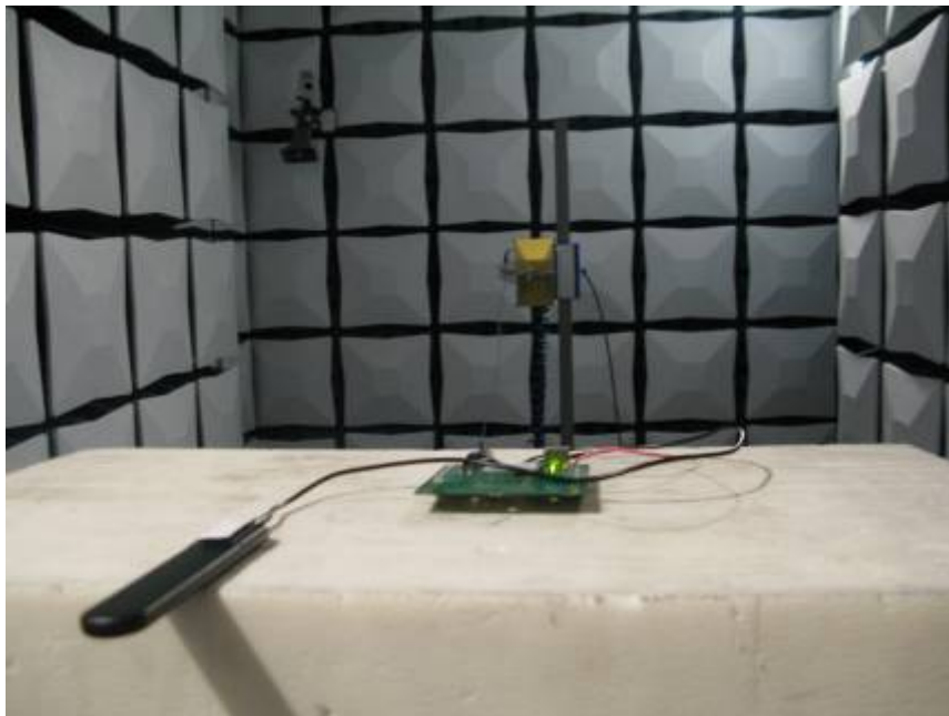
Radiated Spurious Emission (3GHz to18GHz)