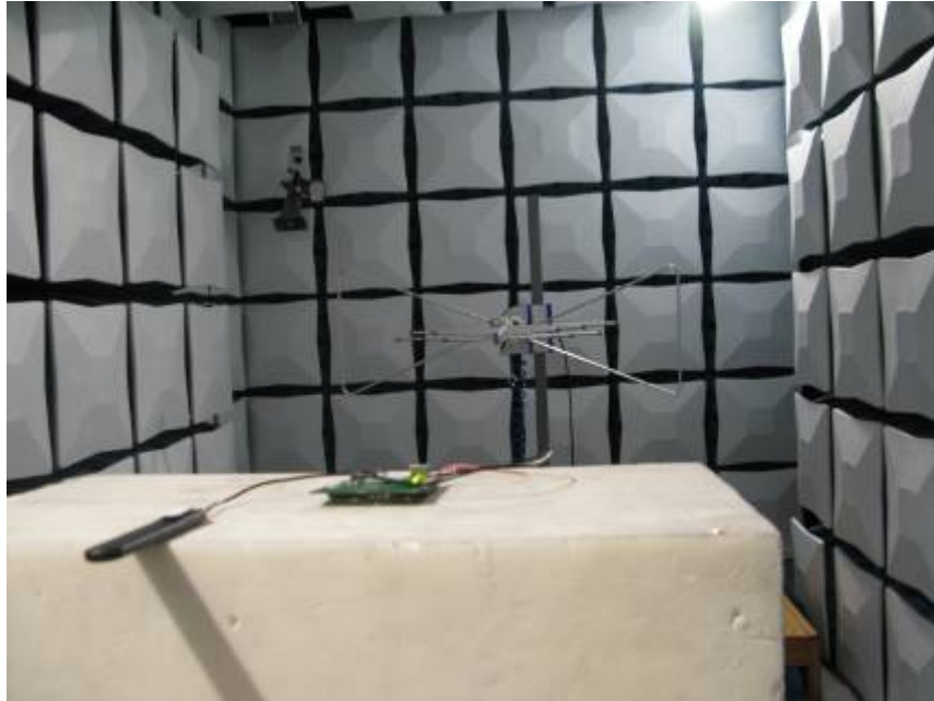
Radiated Spurious Emission (below 3GHz)