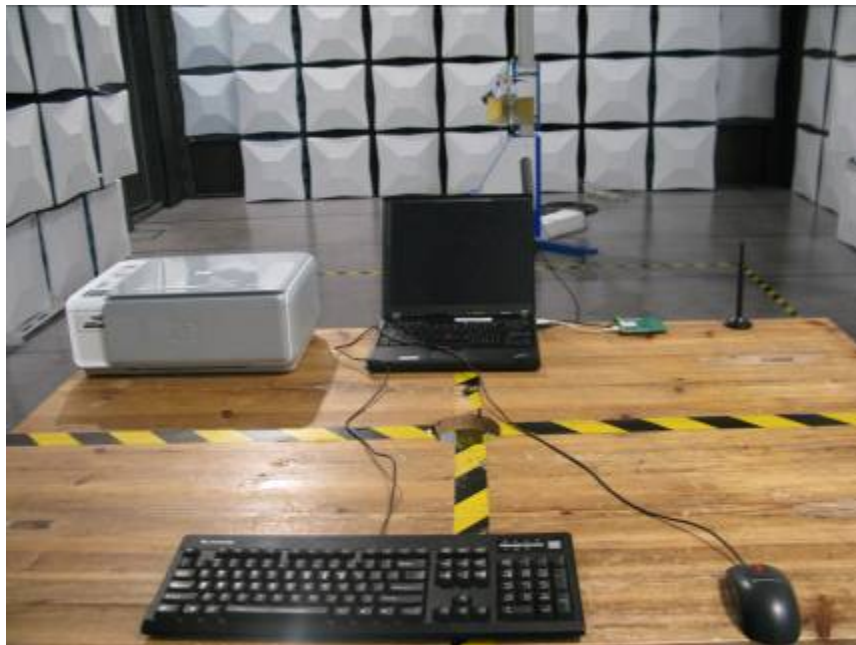
Radiated Disturbance (1GHZ-18GHZ)