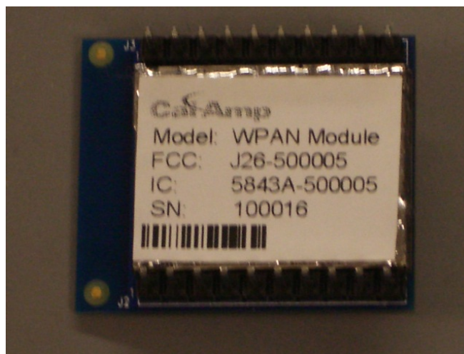
Figure 2: CalAmp Sample FCC Label Note: Bar code font for example only.

The image below shows the mounting placement of the label. The label should be placed on the module shield of all modules prior to shipment.