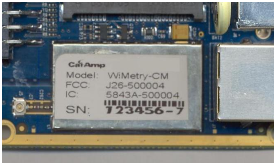
Figure 2: CalAmp Sample FCC Label

The image below shows the mounting placement of the label. The label should be placed on the 802.15 shield of all modules prior to shipment.