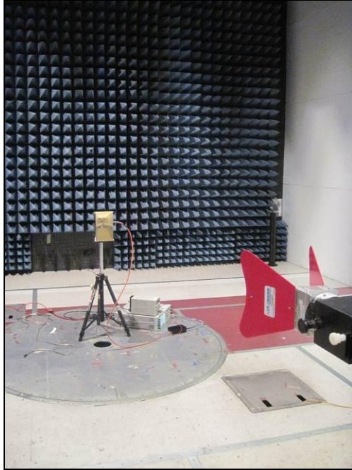
Photograph 1. RF Power Output, Test Setup, 800 MHz