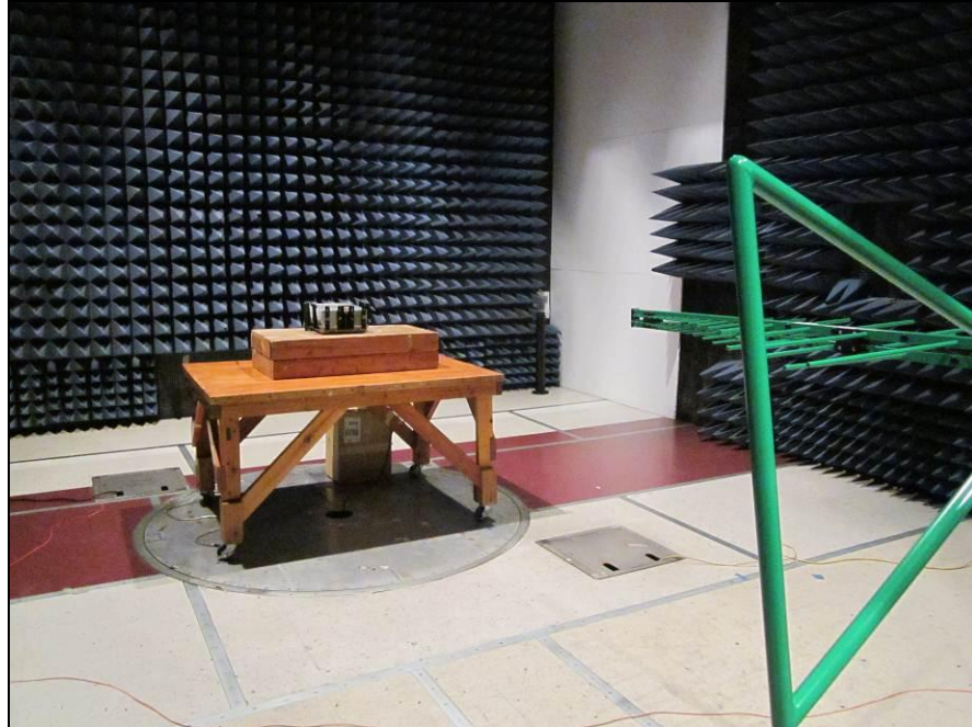
Photograph 3. Radiated Emissions, Test Setup, 30 MHz – 1 GHz