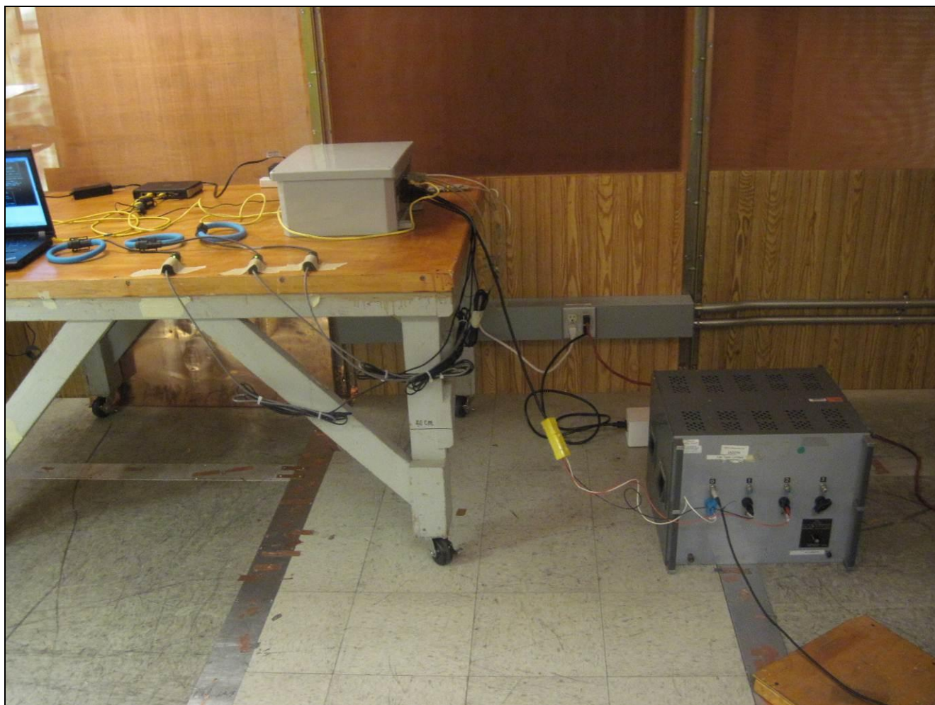
Photograph 1. Conducted Emissions, Test Setup