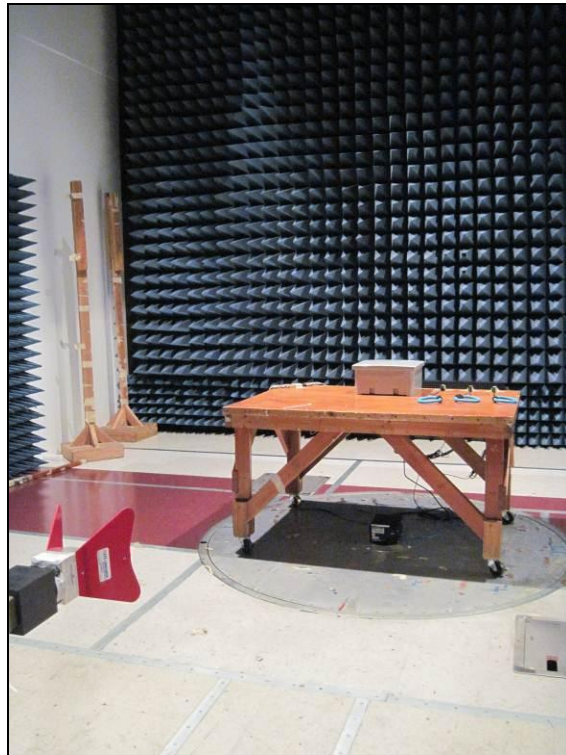
Photograph 3. Radiated Emission, Test Setup, 1 GHz – 10 GHz