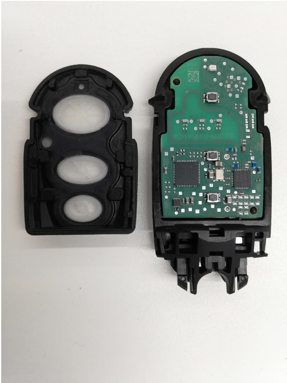
MS6, plastic housing opened