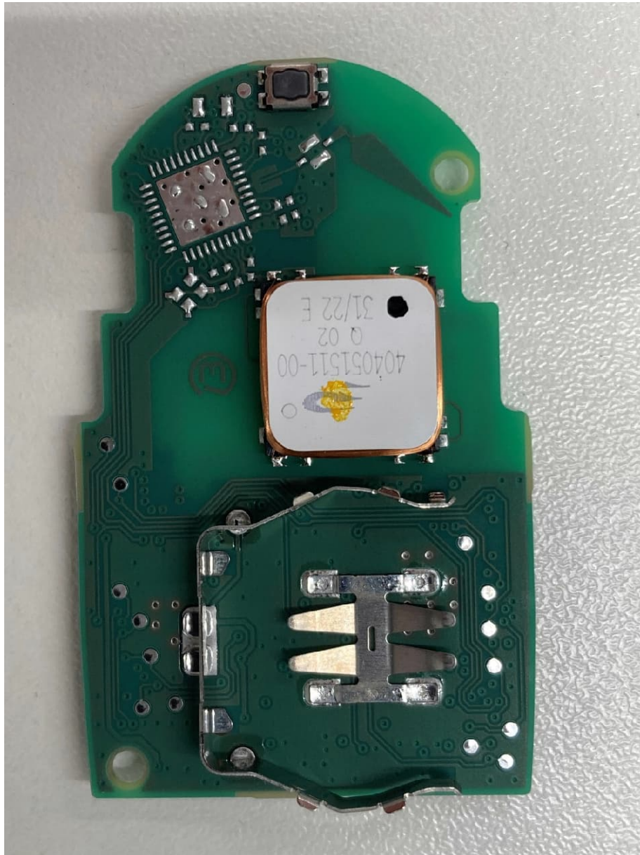
MS6, PCB, bottom view