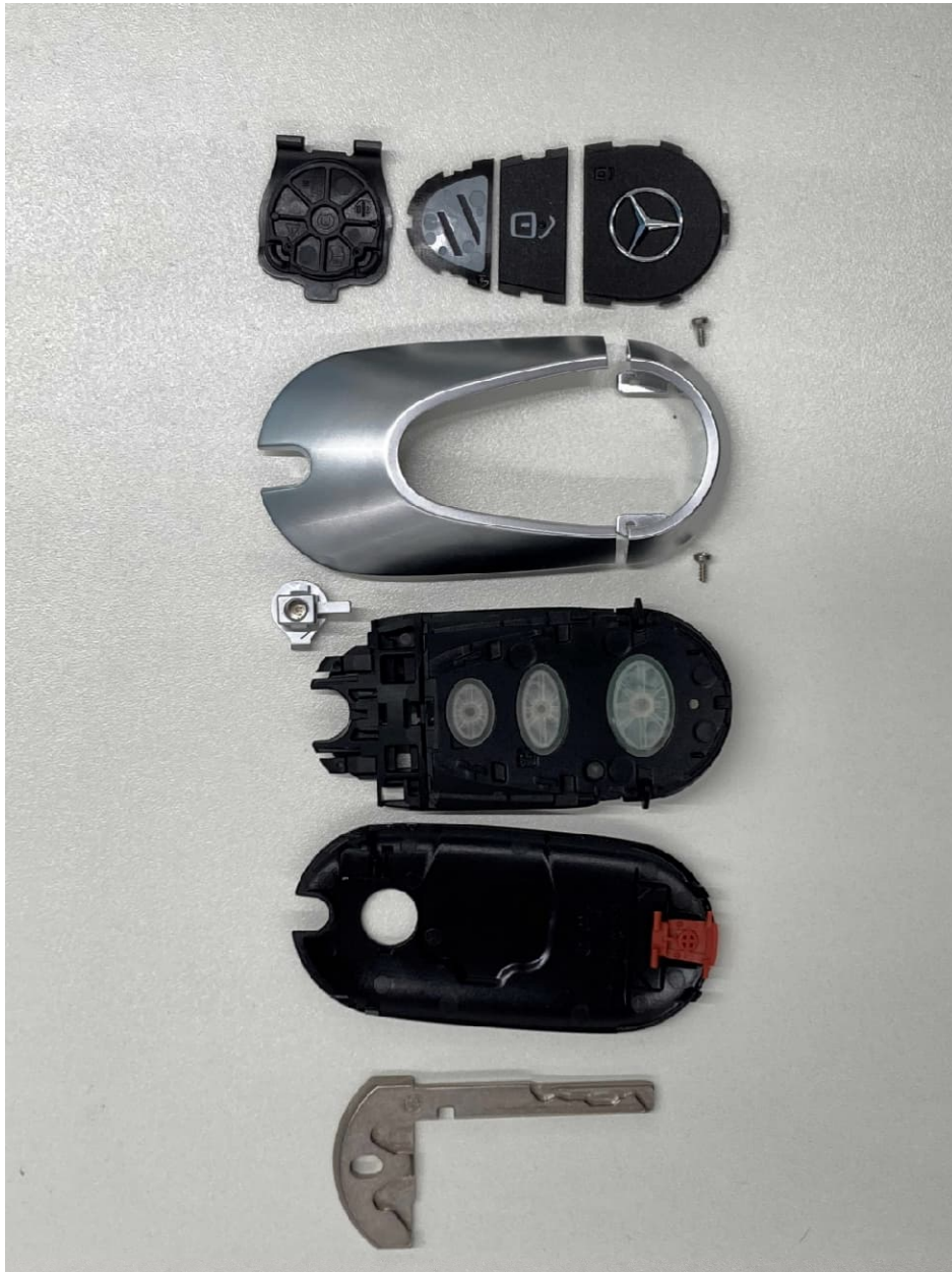
MS6, internal view (all components)