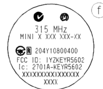
Detail from Customer Drawing