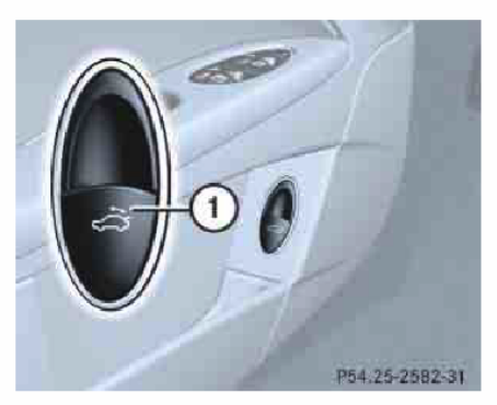
1 Remote control switch

The boot lid remote control switch is located on the driver's door.