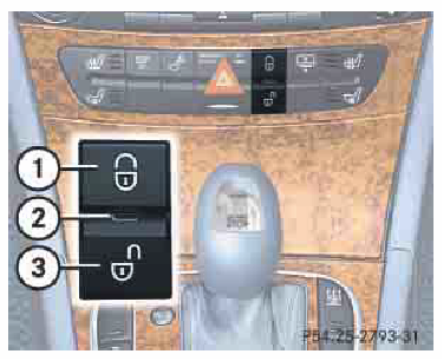
Central locking button

The central locking button is on the centre console.