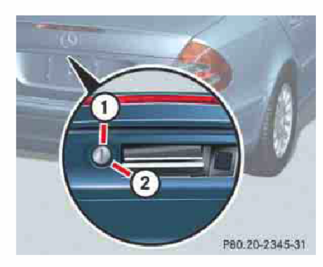
1 To unlock 2 To lock