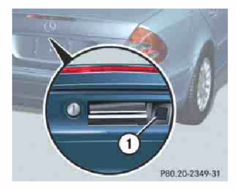
1 Boot locking button

Press the locking button on the door ( \triangleright page 51) or on the boot lid.