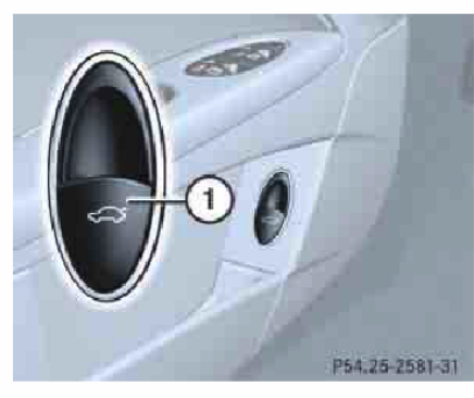
1 Remote opening switch

The boot remote opening switch is located on the driver's door.