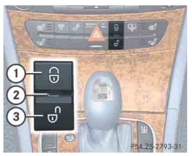
Central locking button

The central locking button is on the centre console.