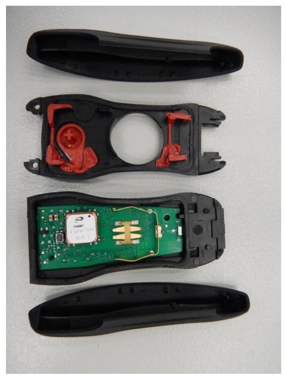
153783_12.JPG: PK1, bottom view (side covers and rear cover removed)