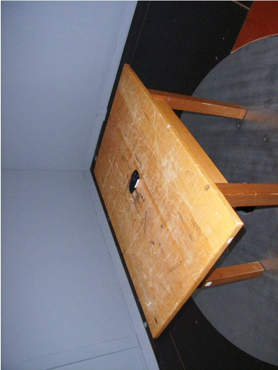
91952_III.jpg FFB, test setup open area test site

Annex A of test report F091952E4 EUT: FFB Variant 1 / 3397.0203-01 and FFB Variant 2 / 3397.0601-01 Manufacturer: Marquardt GmbH