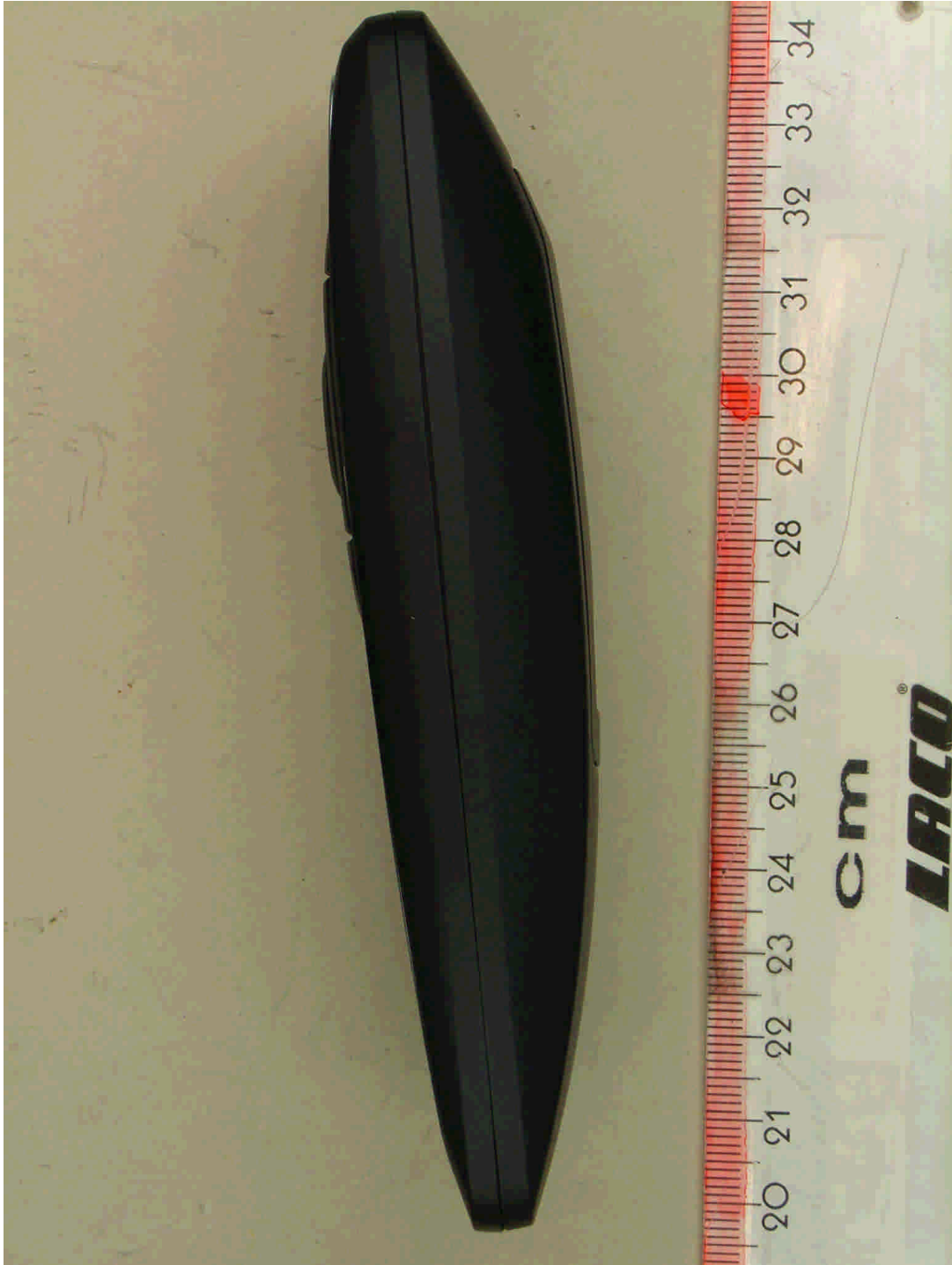
81168_4.jpg FFB, right hand view

Annex B of test report F081168E02 second version EUT: FFB Manufacturer: Marquardt GmbH