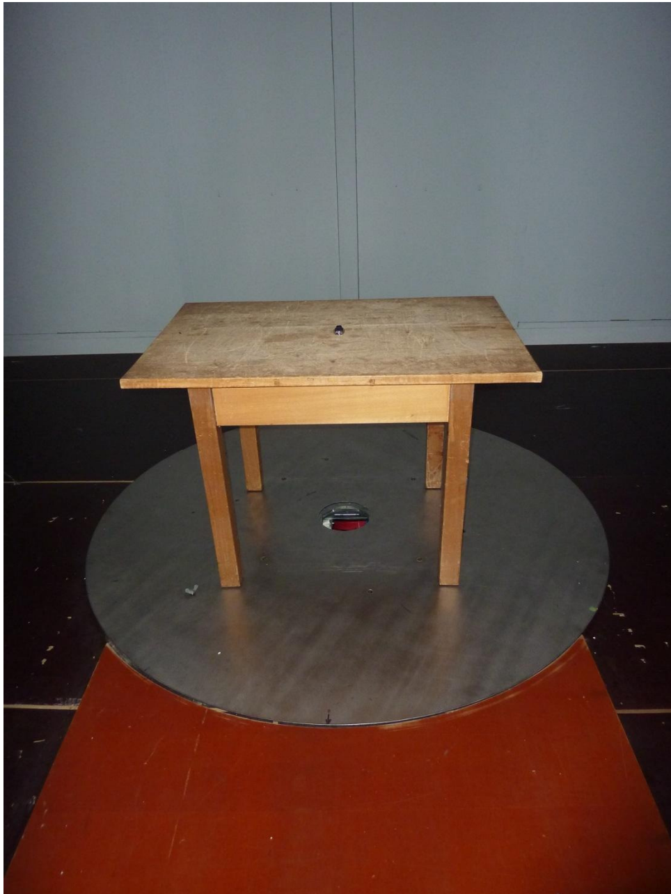
153783_4.JPG: Test setup open area test site