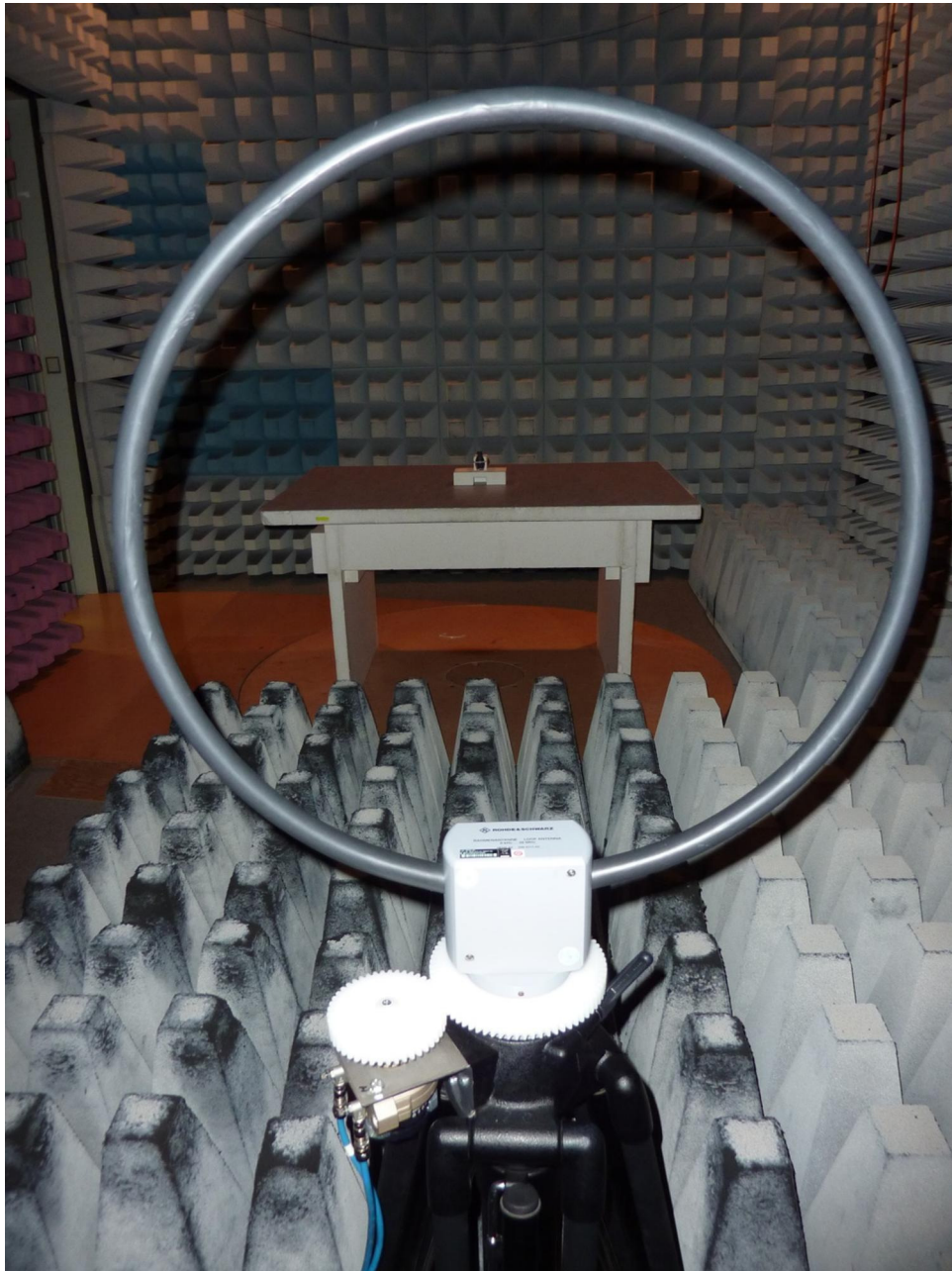
153783_1.JPG: Test setup fully anechoic chamber