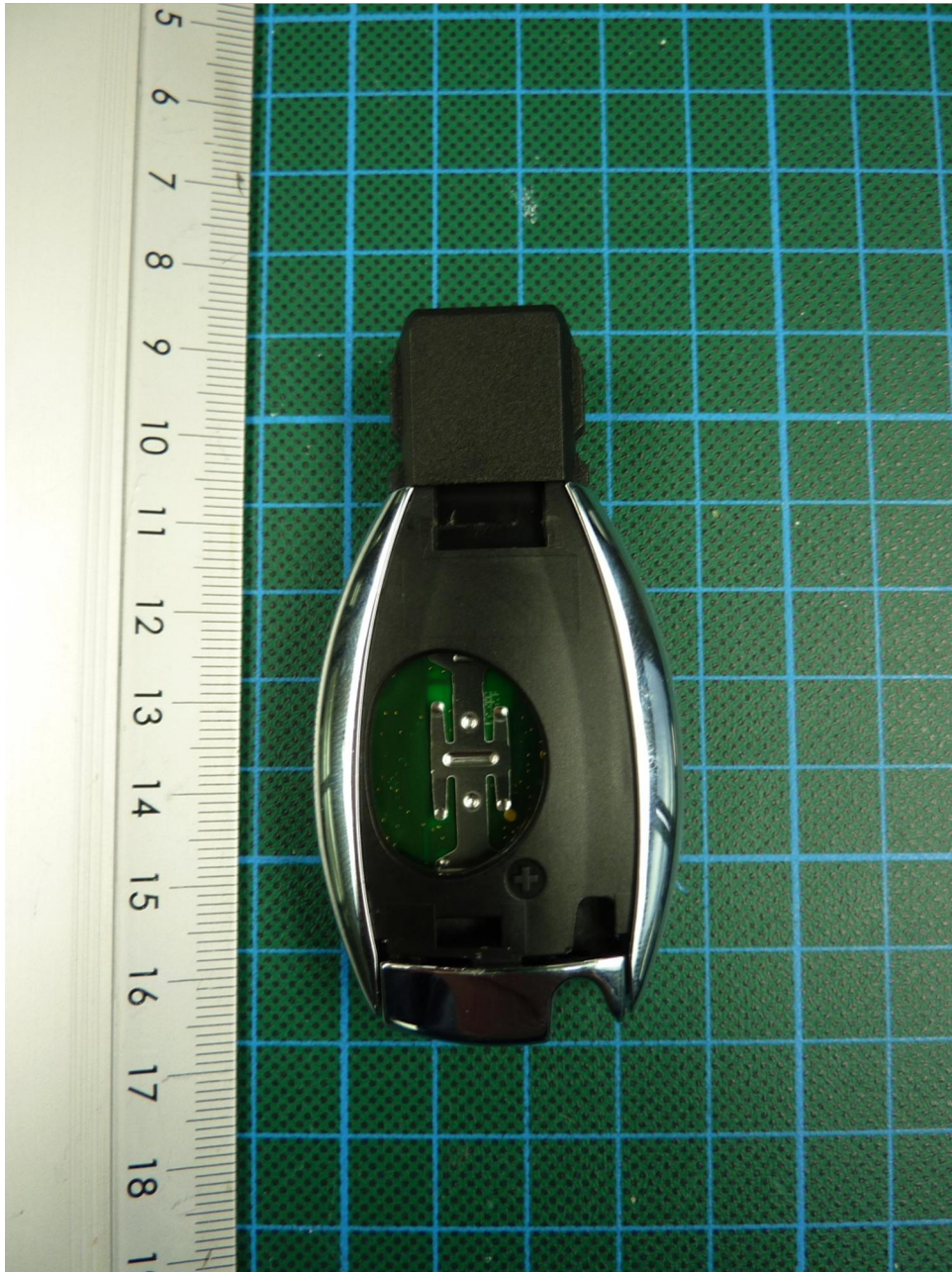
153783_17.JPG: DC12A, bottom view (battery cover removed)