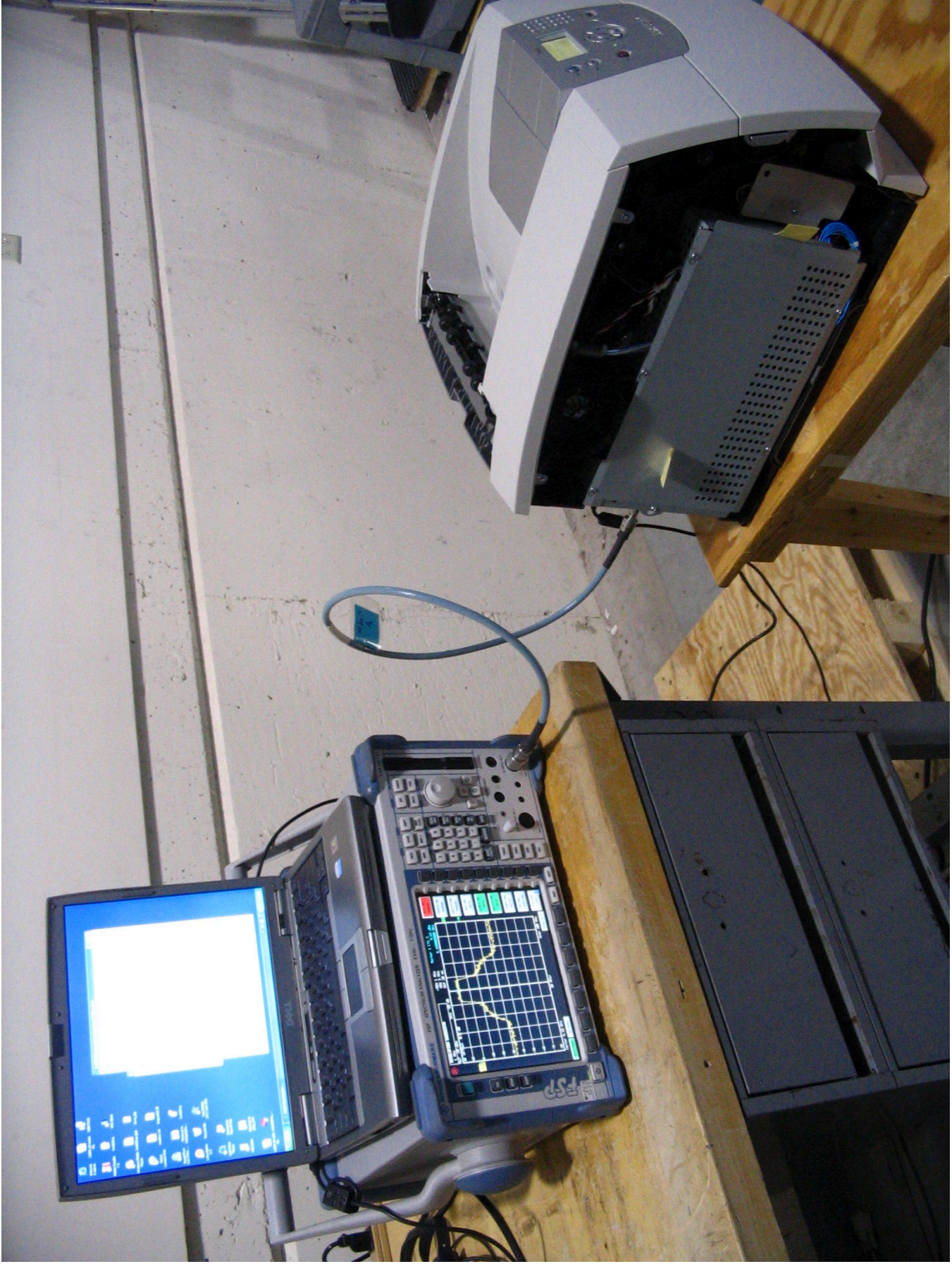
Figure 5: Conducted Measurements at the Antenna Terminal