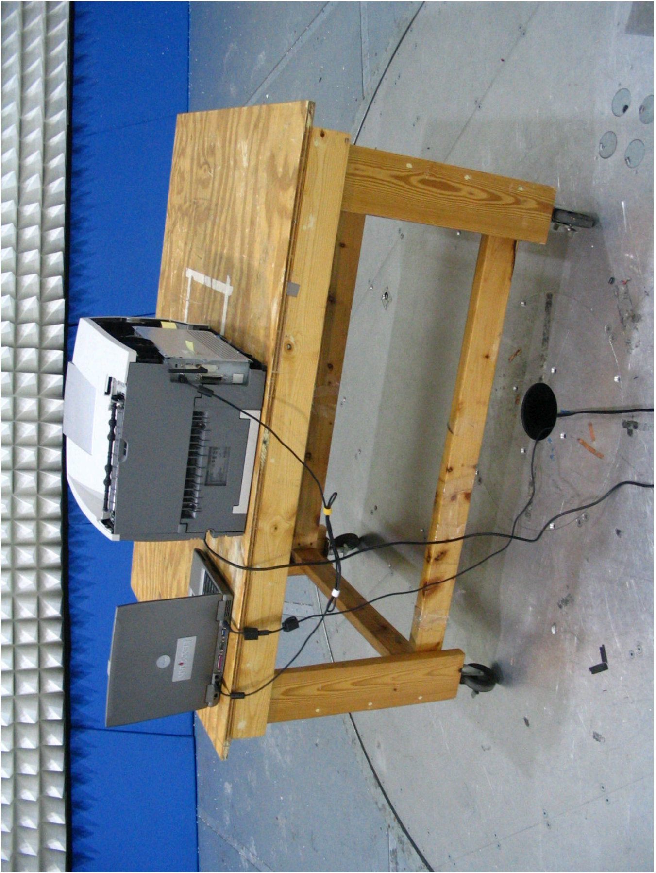
Figure 2: Radiated Emissions Back Side