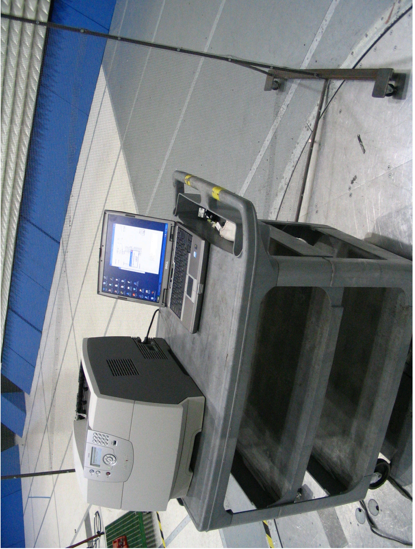
Figure 3: Conducted Emissions on the AC Power Port (Front)