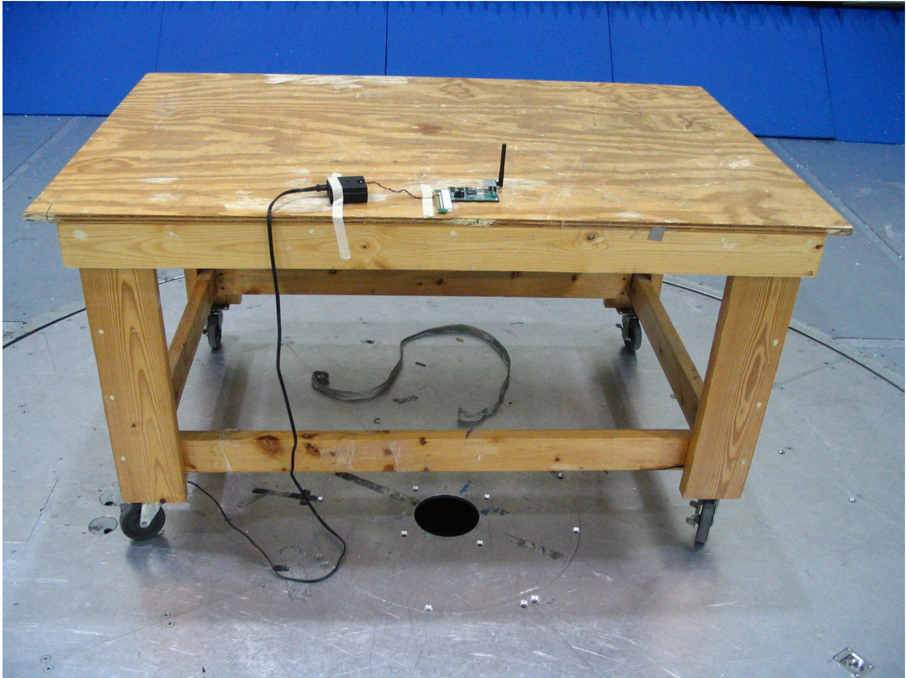
Figure 1: Radiated Emissions Front