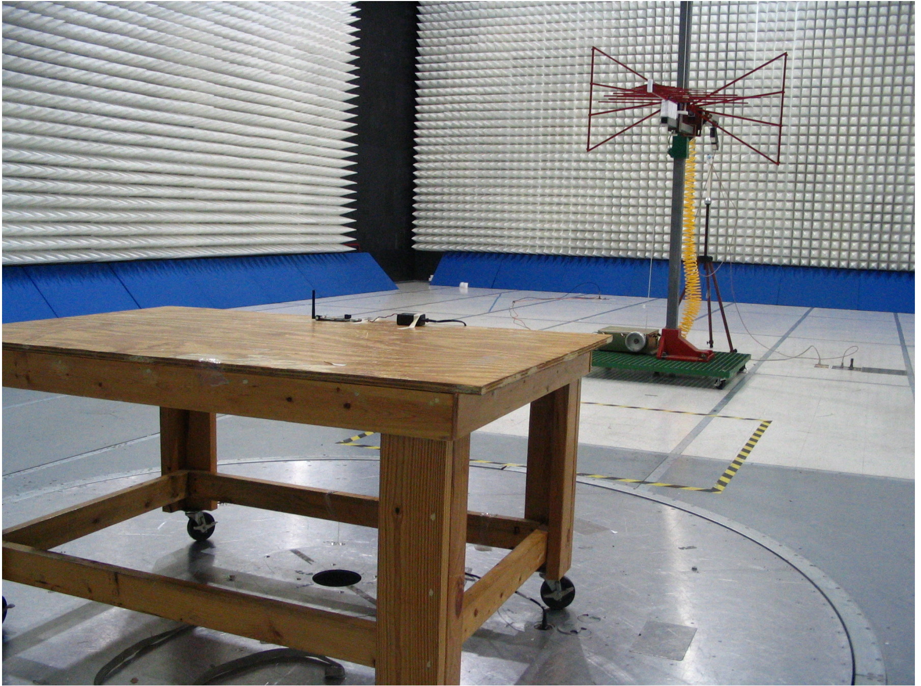
Figure 2: Radiated Emissions Back