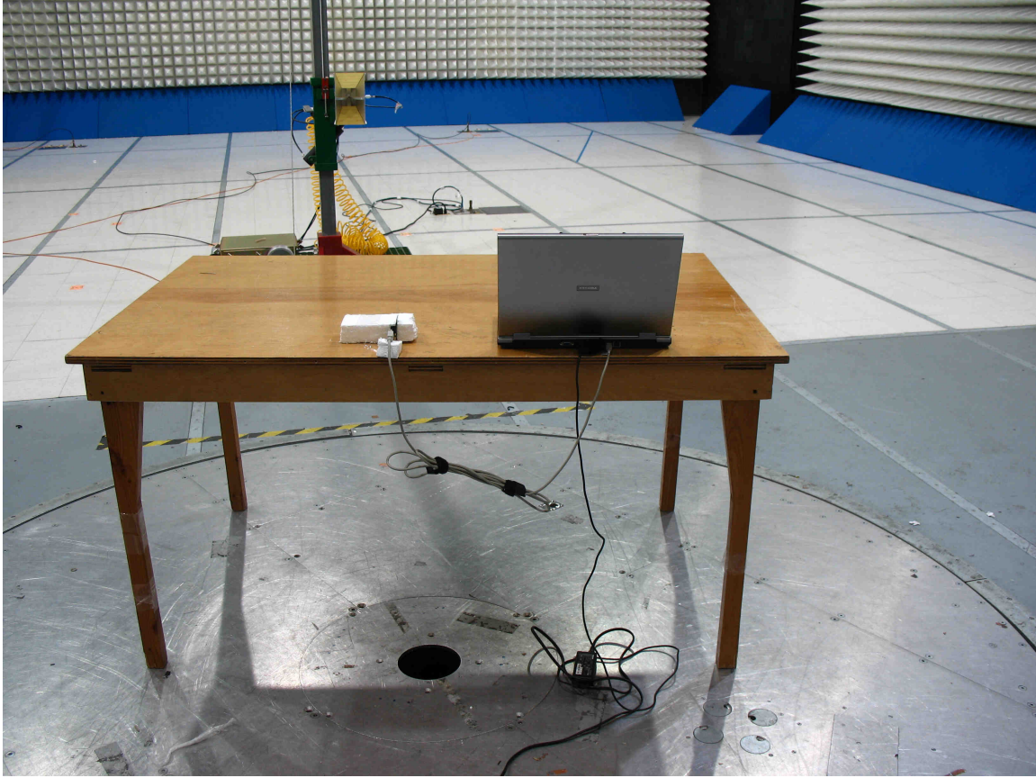
Radiated Emissions (Back)