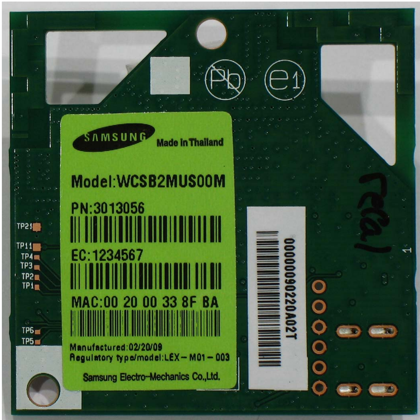
Bottom Side of PCB