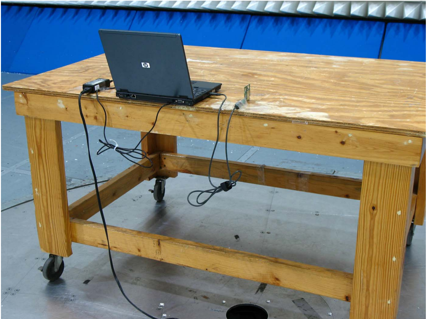
Radiated Measurements (Back)