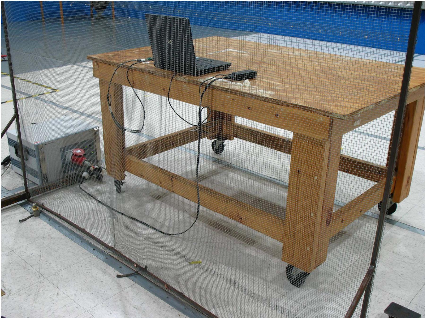
Conducted Emissions on AC Power Port