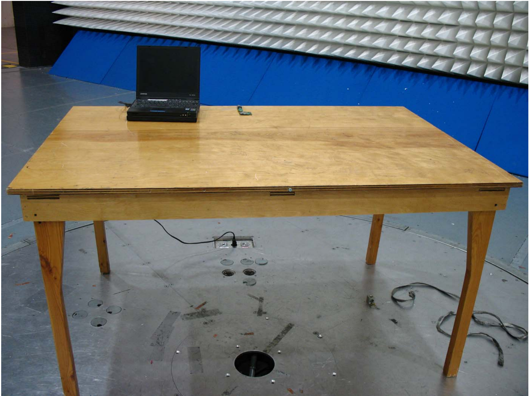
Radiated Measurements (Front)