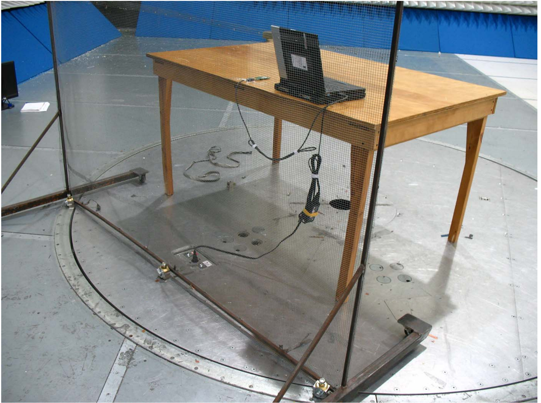
Conducted Emissions on AC Power Port