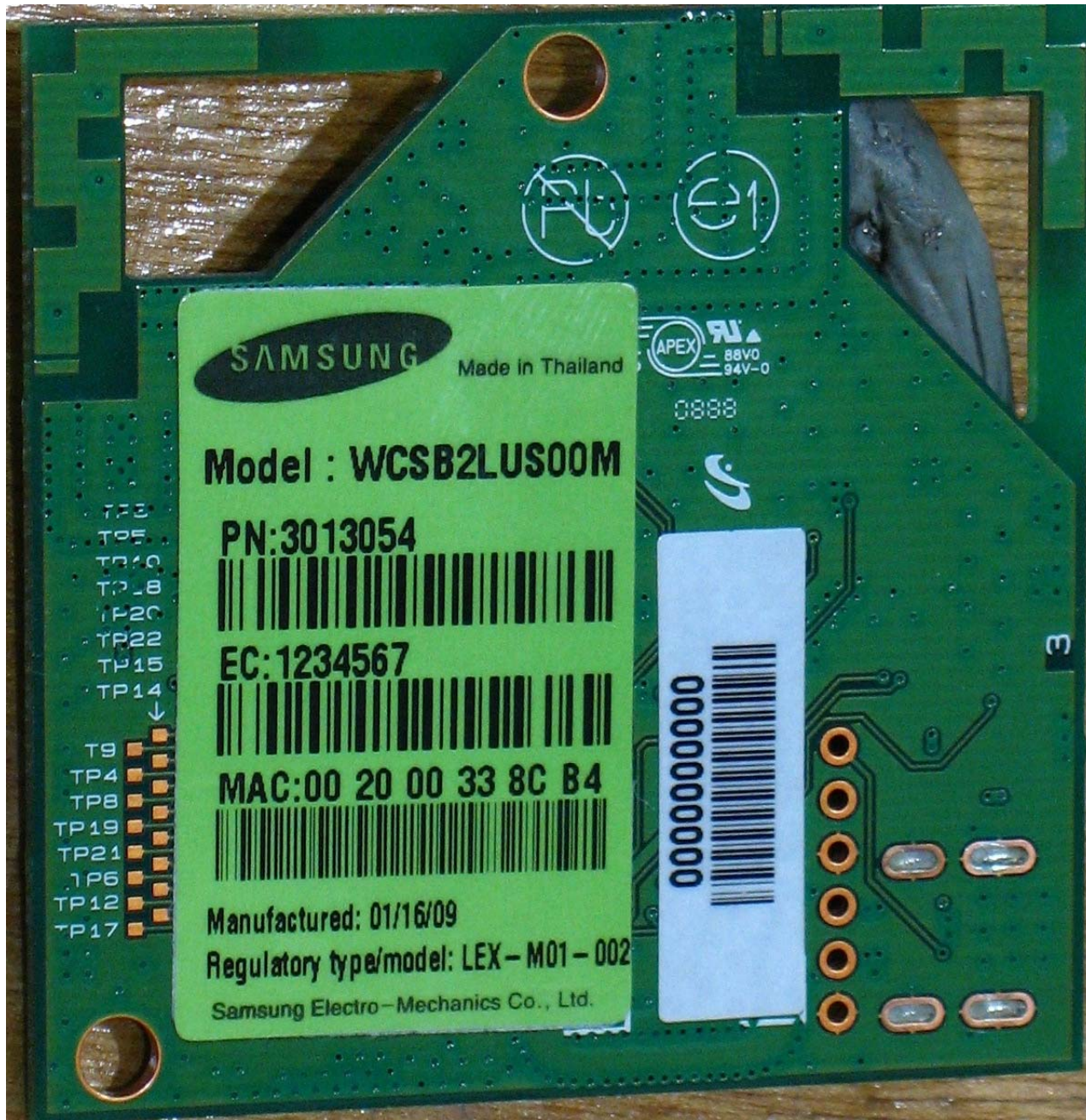
Bottom Side of PCB