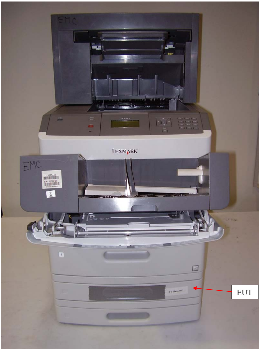
Front view of EUT installed with printer.