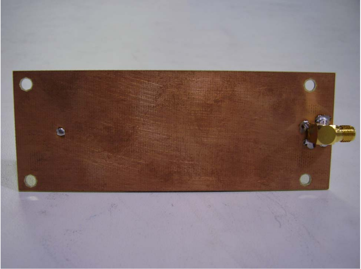
Rear view of antenna.