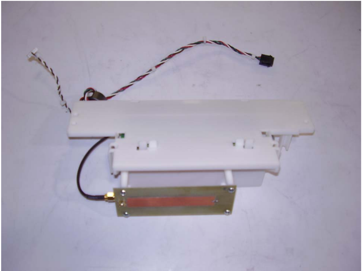
Top view of antenna and radio with mounting bracket.