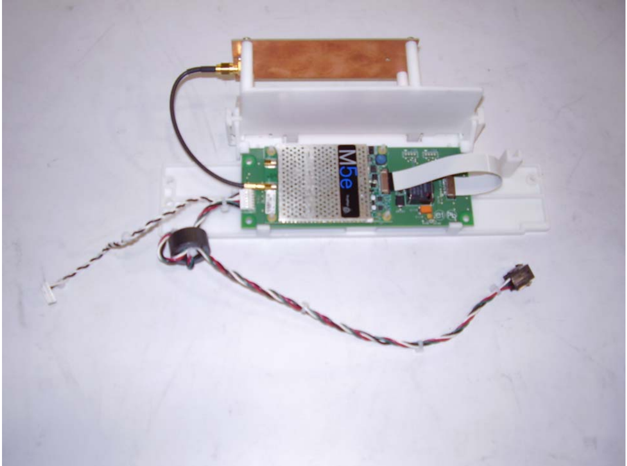
Back view of antenna and radio with mounting bracket.