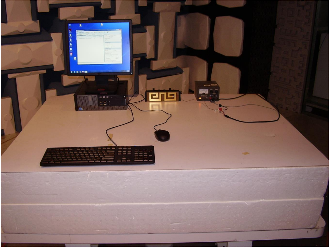
Test configuration for transmitter radiated spurious emissions 30 – 1000 MHz (front view).