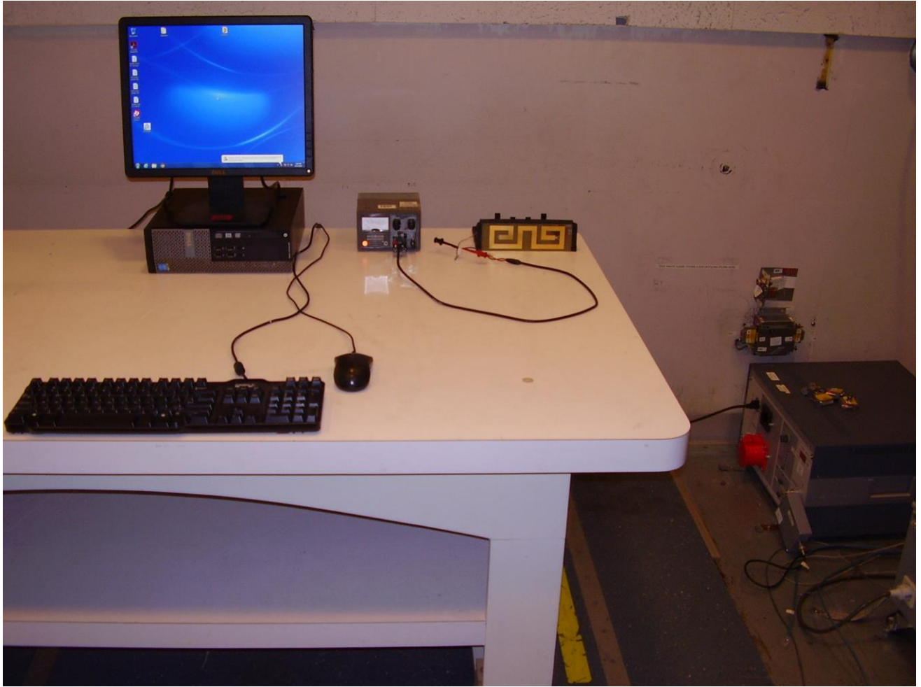
Test configuration for transmitter AC conducted emissions.