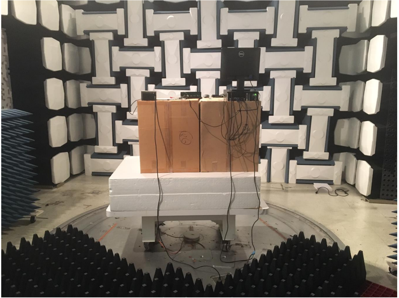
Test configuration for transmitter radiated spurious emissions 1 – 10 GHz (back view).