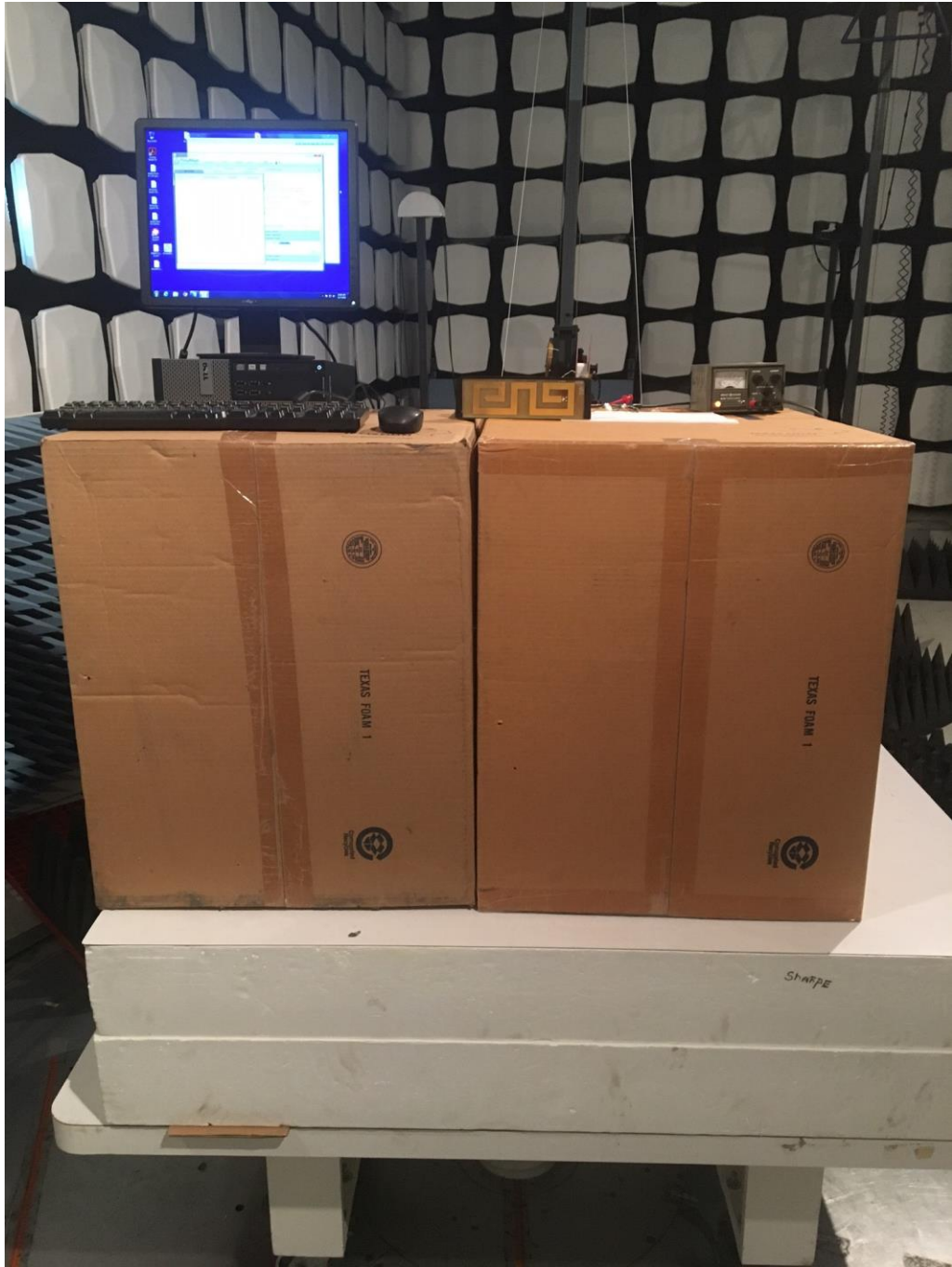
Test configuration for transmitter radiated spurious emissions 1 – 10 GHz (front view).