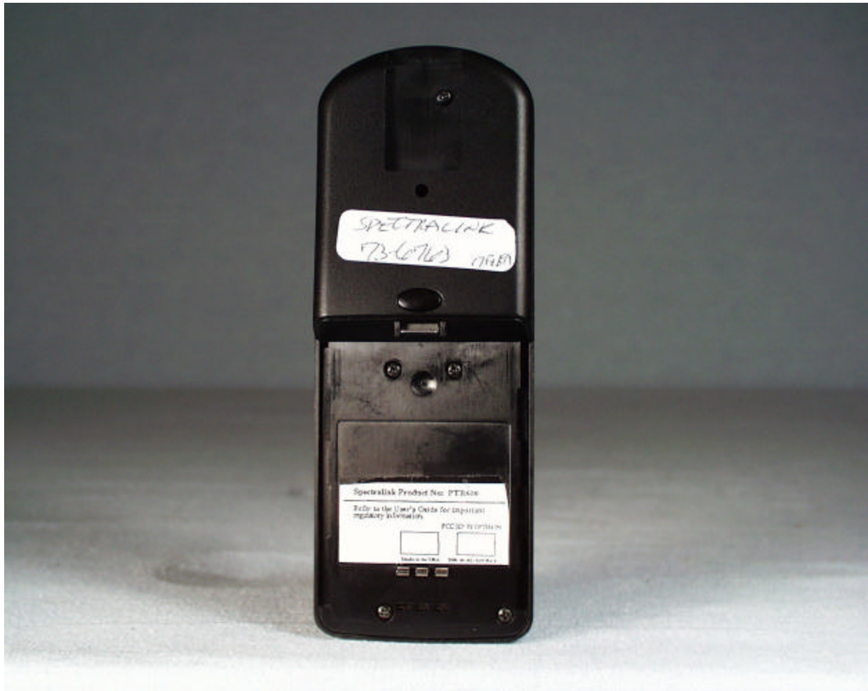
Photograph showing the label placement