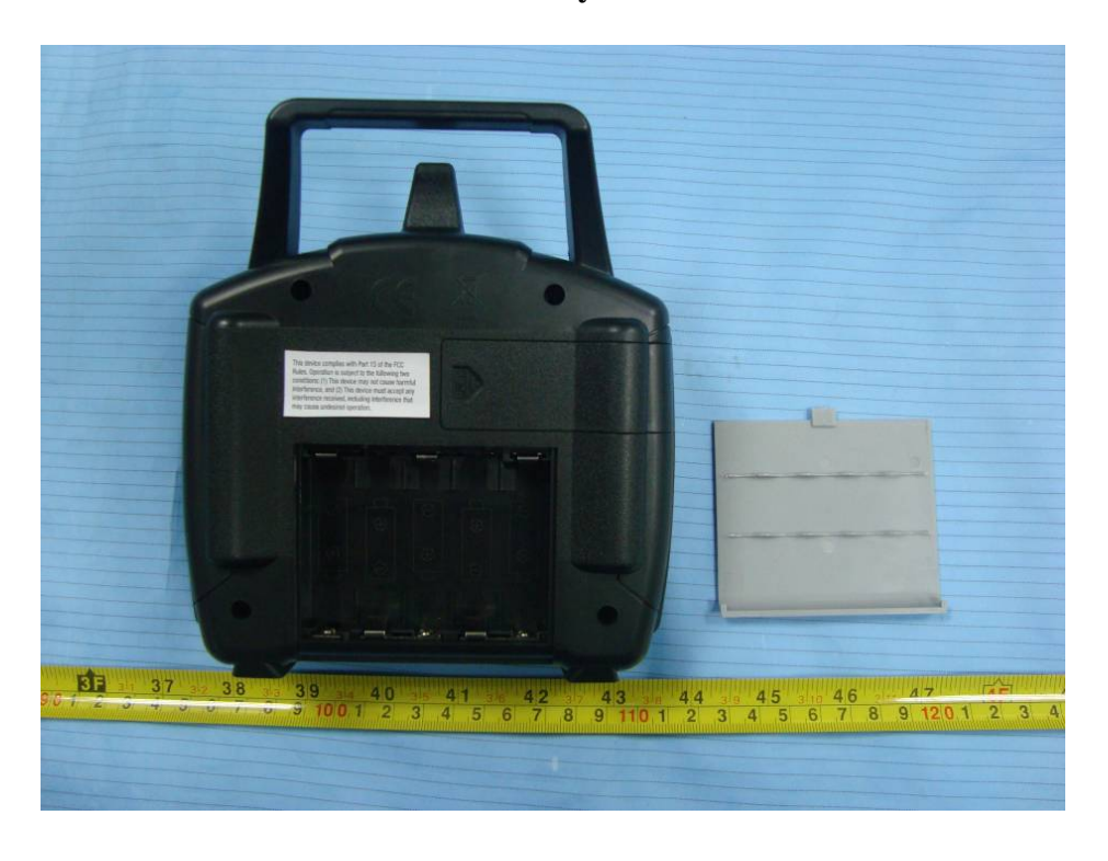
EUT – Cover off View 1