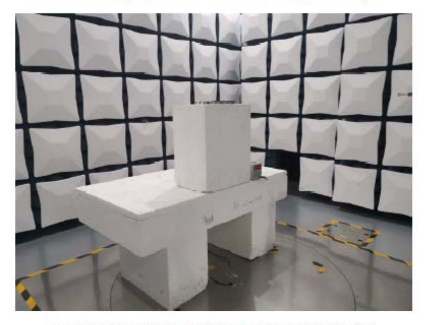
Radiated Spurious Emissions Test View (90-100GHz)