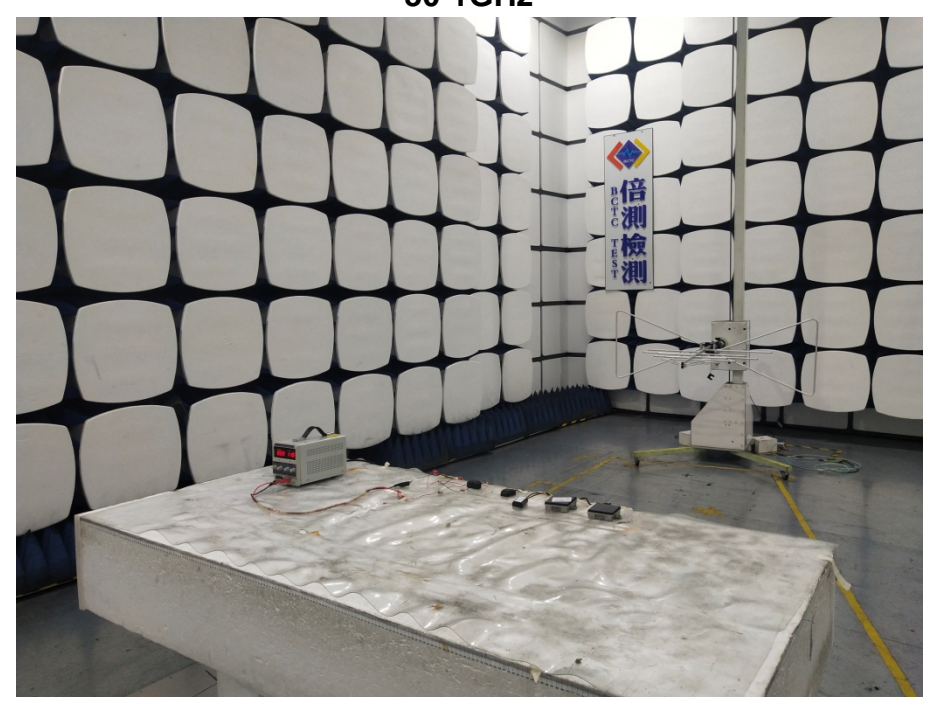
Radiated Measurement Photos 30-1GHz