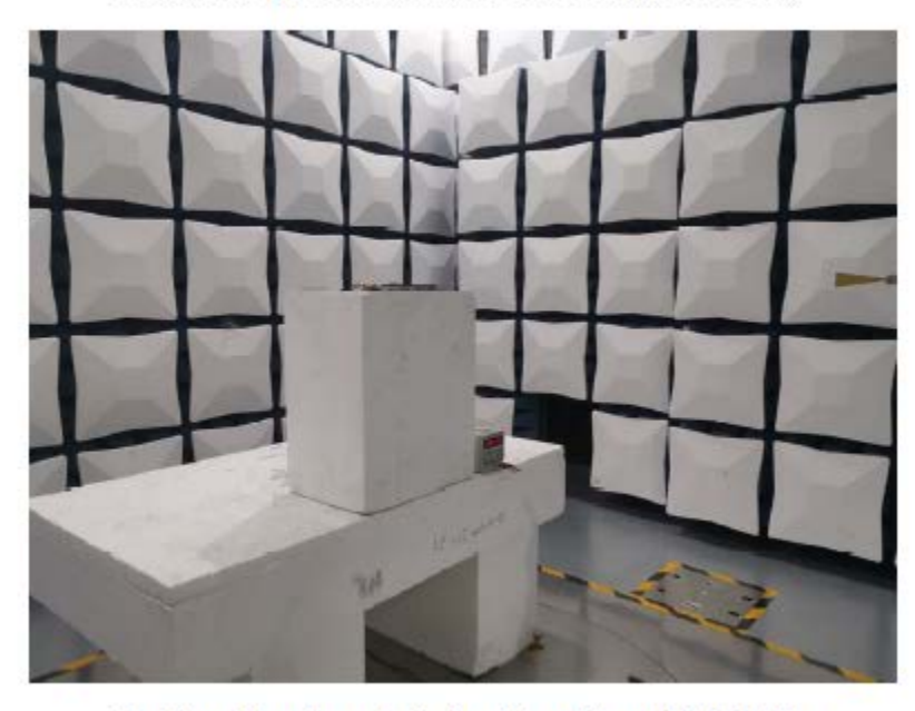
Radiated Spurious Emissions Test View (50-75GHz)