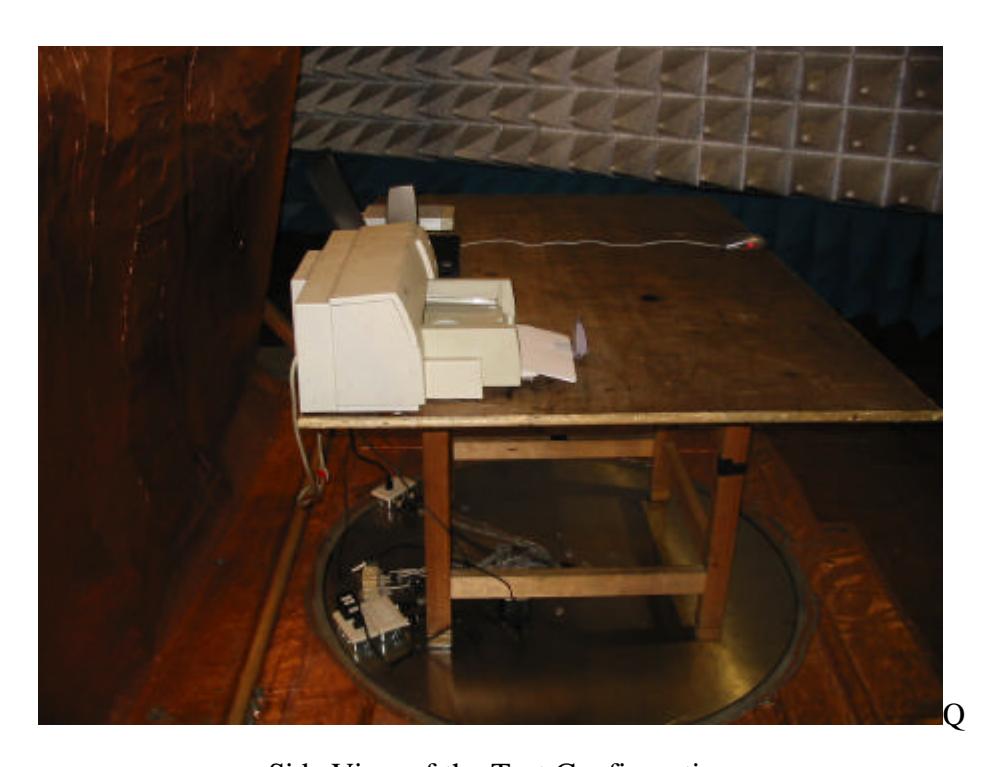
Side View of the Test Configuration