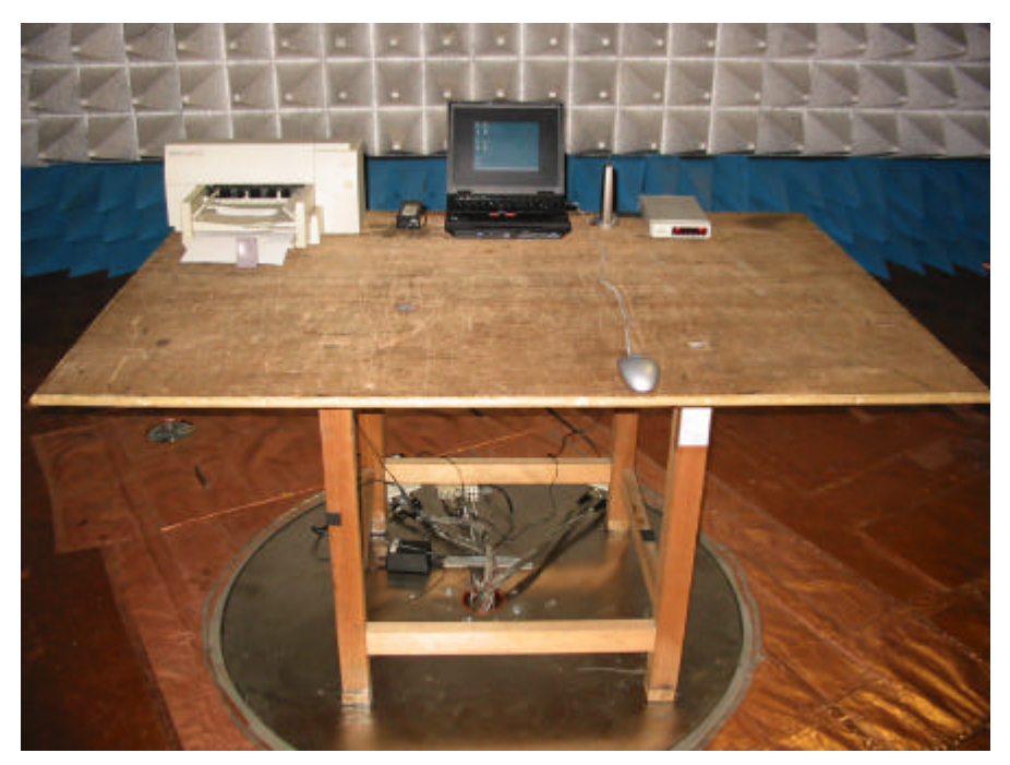
Front View of the Test Configuration