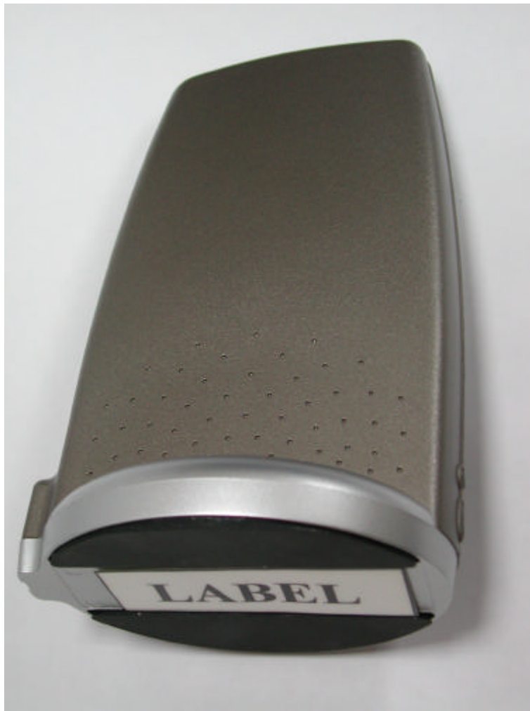
Label Location of the USI LC_USB