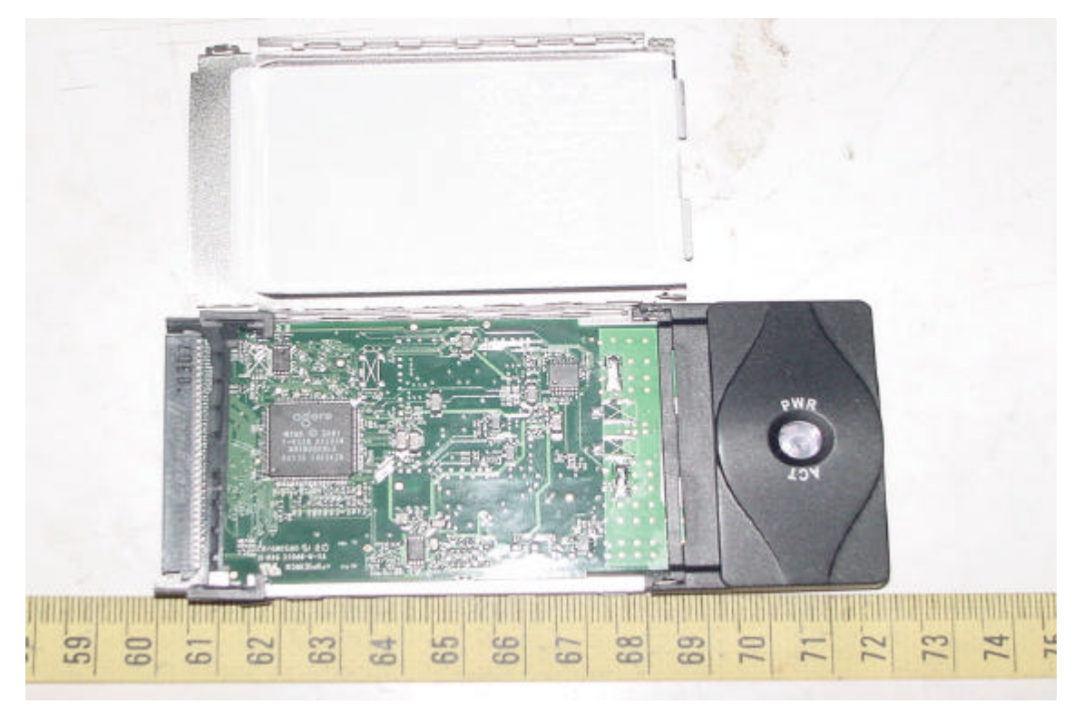
Internal View of EUT