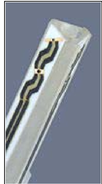
Inside View of ET3DV6 E-field Probe